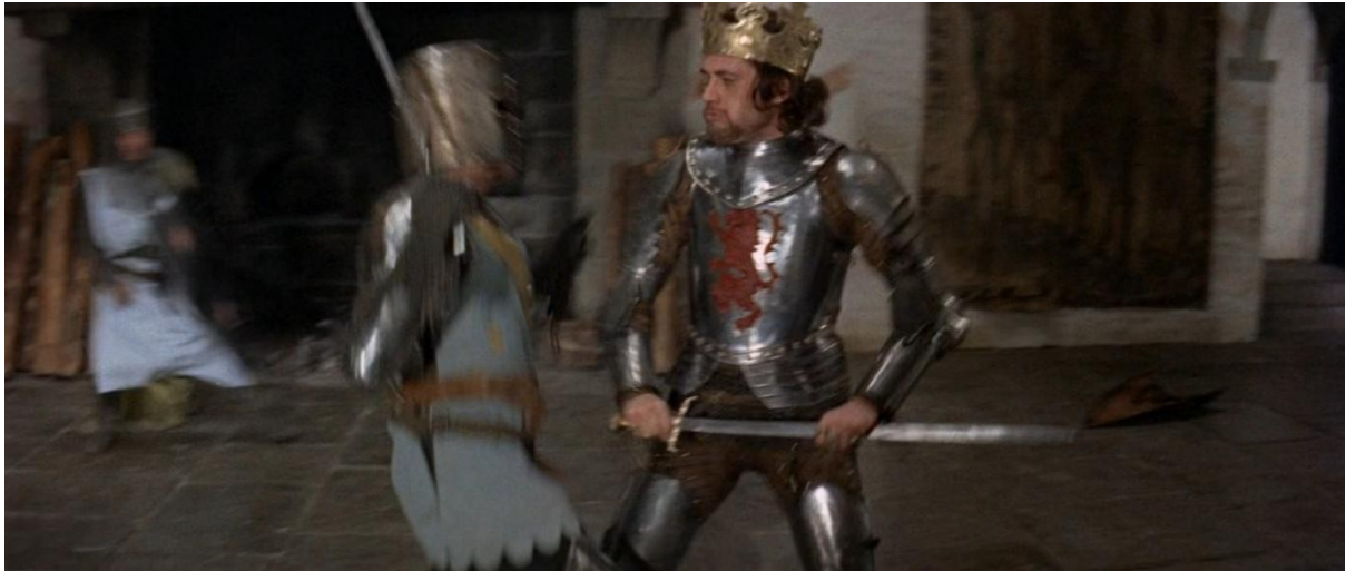
Figure 3: Macbeth's duel