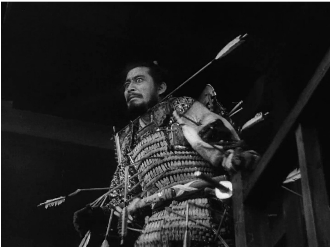
Figure 18: Death of Washizu (Source: Kurosawa's Throne of Blood , 1957)