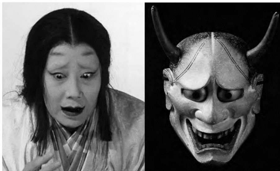
Figure 2: Hannya mask

Fujaki mask shown in the picture is used to show the sorrow of a woman who lost her child.