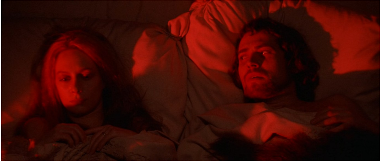
Figure 14: Red light scene (Source: Polanski, Macbeth, 1971)

In Throne of Blood , the plot gets even more intense after the guests leave the banquet. Washizu's henchman arrives and brings Miki's head to Washizu and his wife. Washizu is furious when he finds out that Miki's son lives and goes into a murderous rage, killing his henchman. During this time, Asaji stays peaceful, just like Lady Macbeth did. She then descends into darkness. Kurosawa is also using light, and in this case shadow as a tool for the plot of the movie, but in a different way than Polanski did.