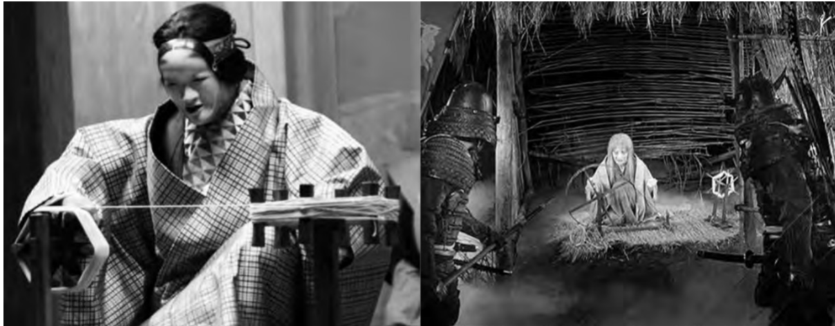
Figure 13: An old woman in Throne of Blood.

Both Polanski and Kurosawa presented that scene very well, but Kurosawa's version is more memorable, probably because it is more surreal and intense with a special focus on facial expressions. Noh masks were used as an inspiration for the spirit's expressions.