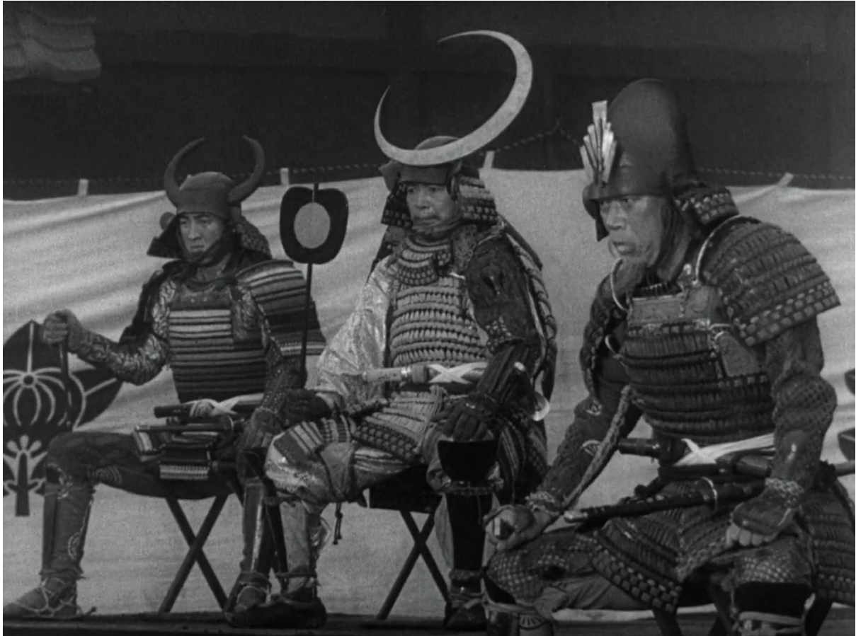
Figure 10: The lord (Source: Kurosawa's Throne of Blood , 1957)