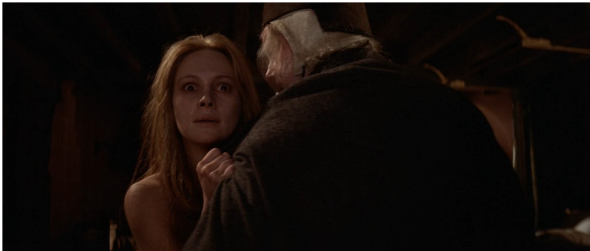
Figure 15: Lady Macbeth with the physician

Another interesting and genius part of the scene is its ending when Lady Macbeth goes back to bed. The front side of her naked body is conveniently covered up by the physician who is helping her walk to bed. This is a very intelligent way to show the character's vulnerability without showing too much of the actress's skin.