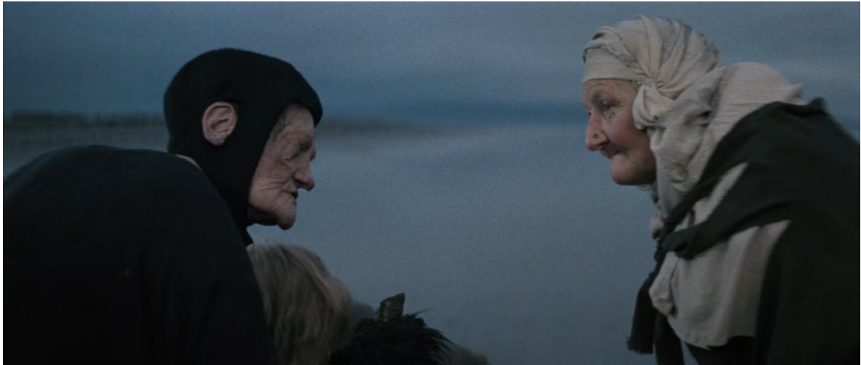
Figure 11: The Witches (Source: Polanski, Macbeth, 1971)