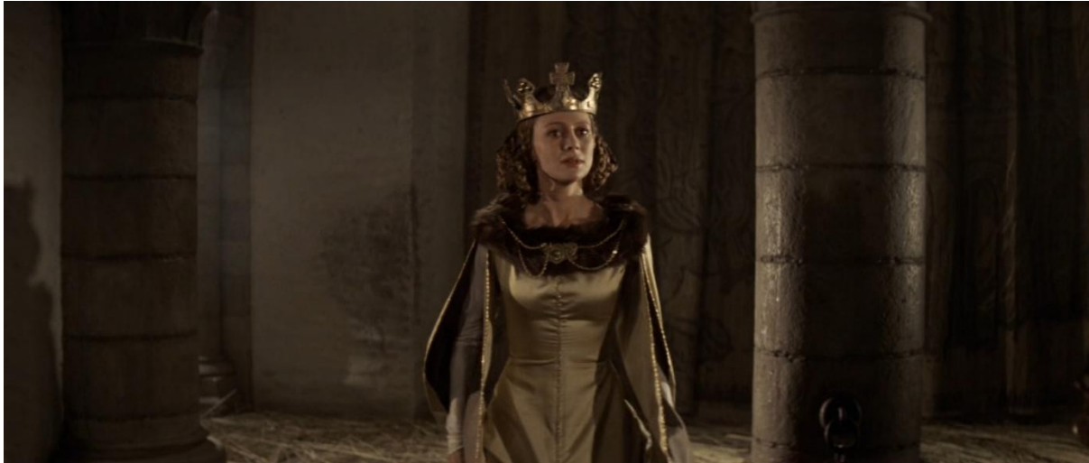
Figure 5: Lady Macbeth

Her dresses are often used for compositions by Polanski to make the shot more vibrant and interesting. Once she lost her mind, she is seen naked which is a stark contrast compared to the posh dresses and fur coats we have seen her wearing up until that point.