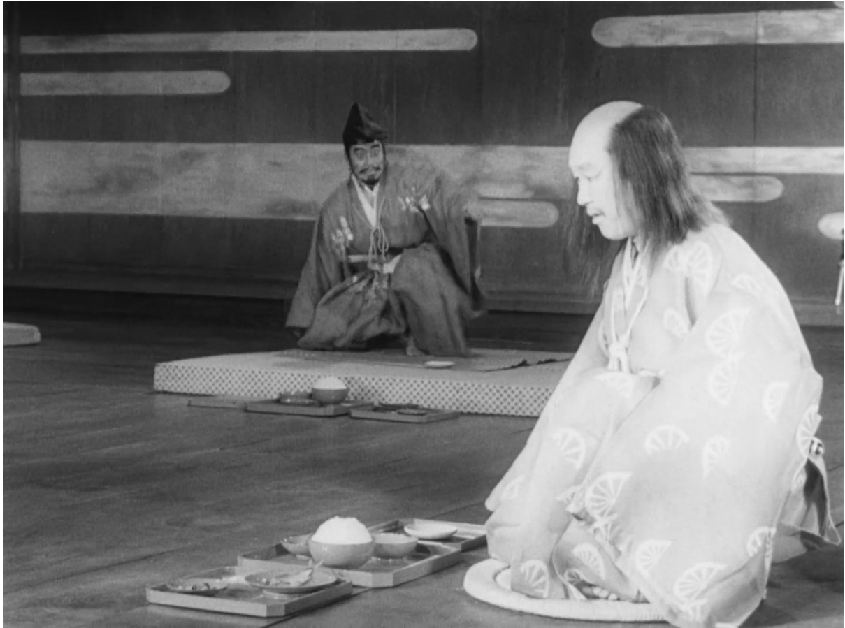
Figure 8: Miki's ghost