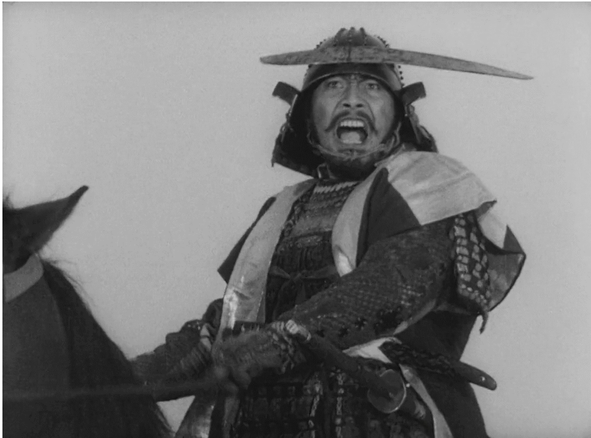
Figure 4: Washizu

Washizu's acting style is full of sudden movements and exaggerated facial expressions are in contrast with expectations from a samurai. His temper plays a big role in his character development and is used as one of the main plot devices.