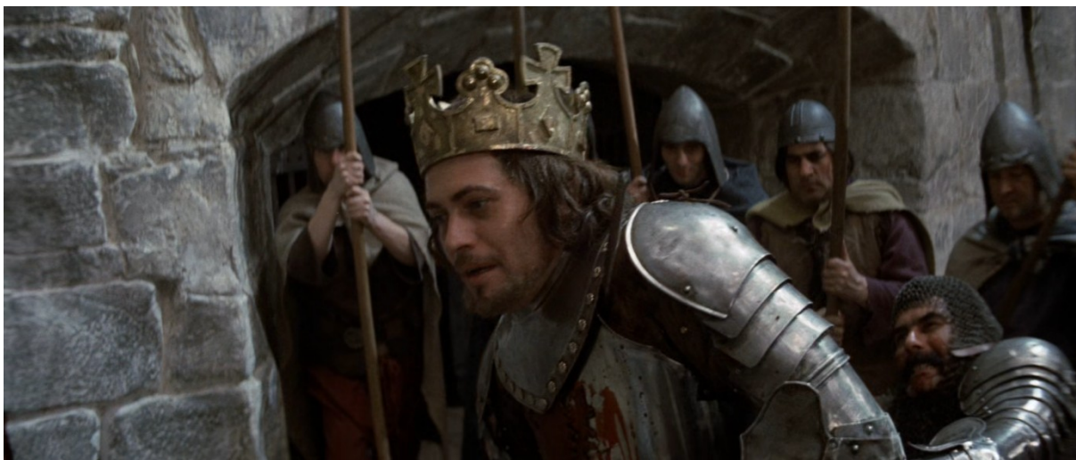
Figure 17: Macbeth smiles

After that, they continue to fight all around the courtyard until Macduff finally reaches for his sword and stabs Macbeth. In a fragment of a second, we can see Macbeth lightly smiling as the sword slashes through his flesh. This detail is somewhat disturbing, it gives away Macbeth's absolute loss of sense. He is smiling even though he received a fatal wound.