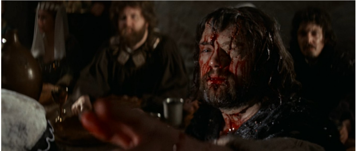
Figure 7: Banquo's ghost