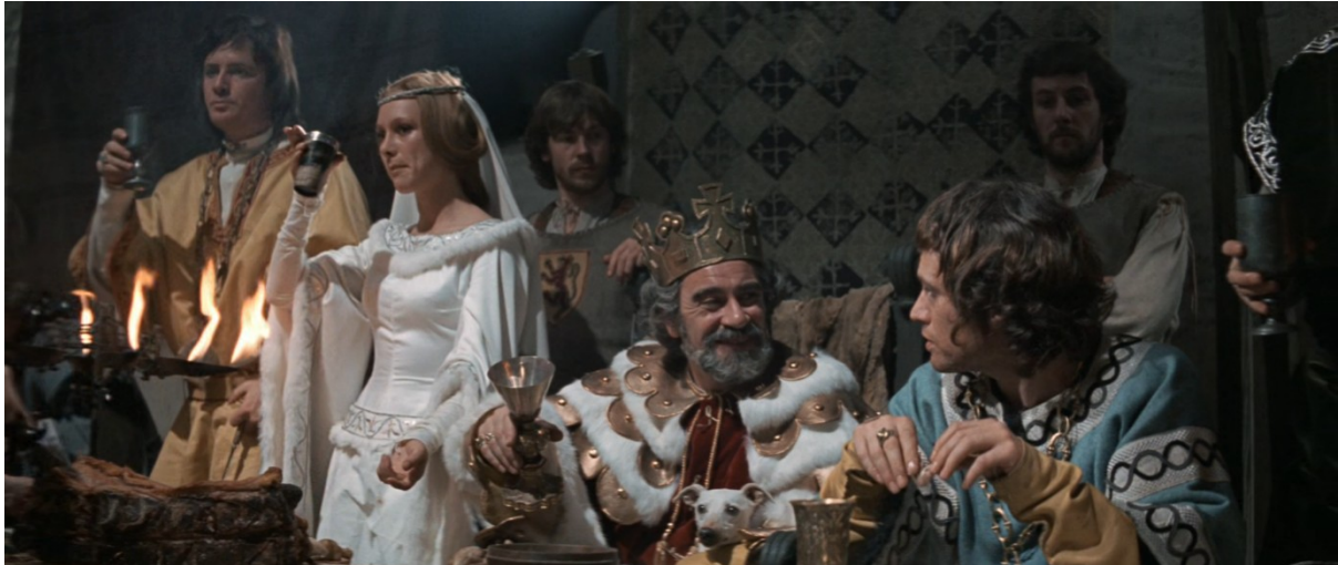
Figure 9: King at the banquet

We last see the King Duncan bare-chested in his bed which shows his weakness and vulnerability as Macbeth ends his life.