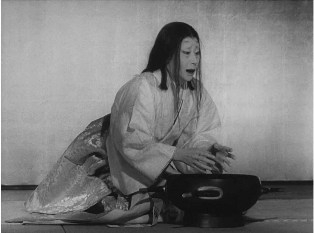
Figure 6: Asaji (Source: Kurosawa's Throne of Blood , 1957)