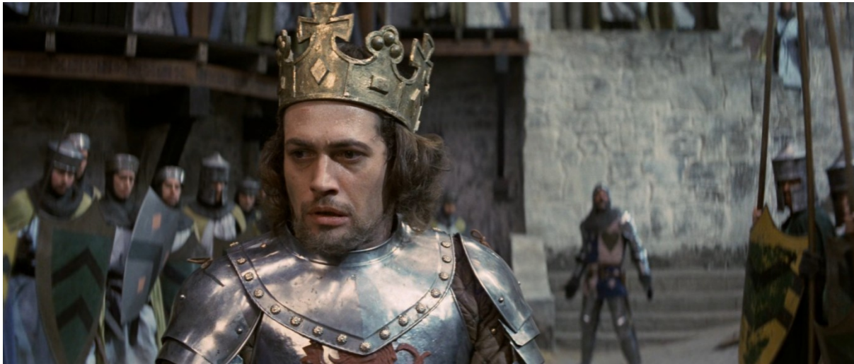
Figure 16: Macbeth in fear (Source: Polanski, Macbeth, 1971)

This moment is very important for the film. It is a moment Macduff reveals that he was born via caesarean section, and Macbeth realizes that it means Macduff is the one that was not born of a woman, the one that can kill him. When Macduff solemnly announces that, we can see drops of sweat forming on Macbeth's forehead, it is becoming obvious that he is petrified with fear.