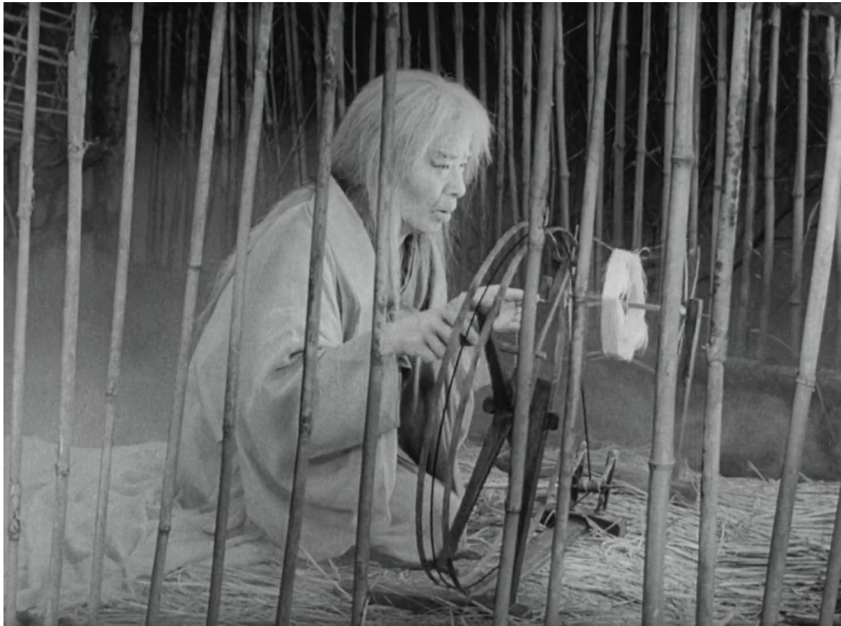
Figure 12: The spirit with the wheel (Source: Kurosawa's Throne of Blood , 1957)

Characters' costumes are a crucial part of film analysis. They not only add to the quality of the film but create a crucial part of the character and their spatial and temporal setting. After introducing characters and describing their costumes and their importance I will present and analyse five major scenes from both films and compare them. I will also point out certain scenography details important for the storyline. I will also compare the scenes from the two films and use other authors' observations that helped me compensate for the parts I missed while watching these films. To make my report full, I will occasionally add images of shots from the film to make my statements and comments more sensible.