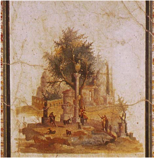
Fig. 4. Detail of columnar structures, red cubiculum (room 16), Villa of Agrippa Postumus at Boscotrecase, ca. 10 BCE. Museo Archeologico Nazionale di Napoli

unfinished temple to Olympian Zeus at Athens, it was to use them in his rebuilding of the Temple of Jupiter Optimus Maximus on the Capitoline, nominally in the same context, then. Materials originating from non-religious contexts would have been free from this restriction.