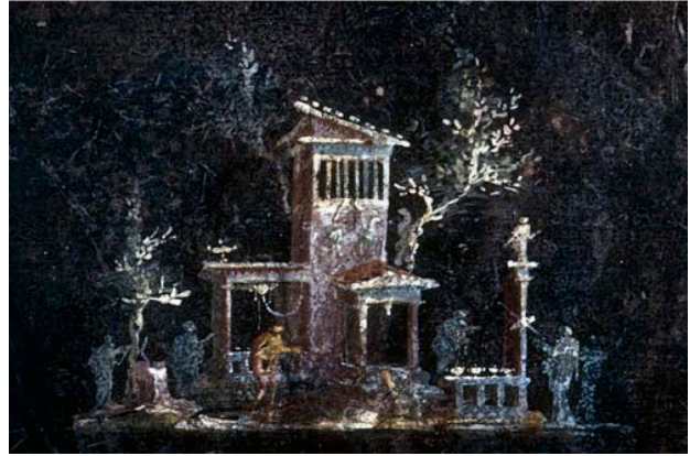
Fig. 5. Details of columnar structures, black cubiculum (room 15), Villa of Agrippa Postumus at Boscotrecase, ca. 10 BCE. Metropolitan Museum of Art

Columns also appear frequently in sacro-idyllic landscapes in Third Style wall painting, inspired by a Golden-Age peace and luxury and perhaps also by a reflection of real landscapes encountered in the Hellenistic east. Landscapes from the red and black rooms of the