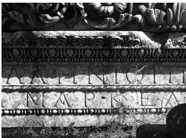
Fig. 14. Iasos (Turkey), Agora, eastern portico, architrave with inscription in white marble

and unquestionable. The same is true for the Euromos provenance of all stepped marbles (nos. 9-11). The marble of column no. 3 is characteristically brecciated and was assumed at first to be a variety of Euromos marble. But this is not the case. However, as shown clearly by the analyses, the exact provenance of this stone could not be determined, despite the fact that the data are compatible with a possible Ephesos 1 origin. The isotopic values and the weak EPR intensity of the floor slab confirm the macroscopic identification as Proconnesian marble. Proconnesian provenance is also suggested for the two cornices nos. 13 and 14, though these artifacts exhibit some atypical parameter values that make their provenance less obvious.