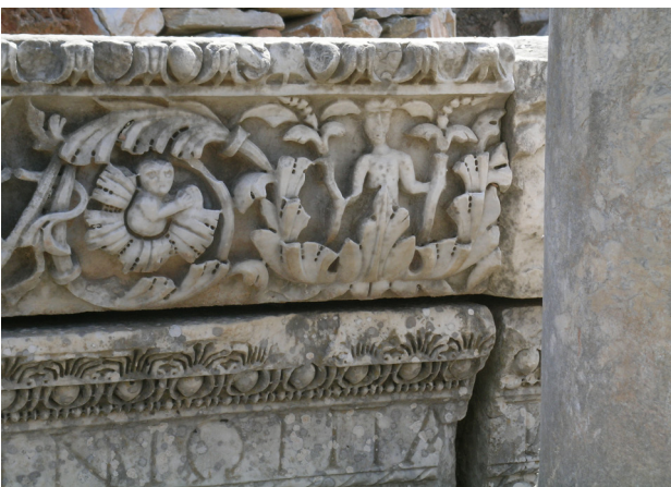
Fig. 3. Iasos (Turkey), Agora, eastern portico, frieze no. 5