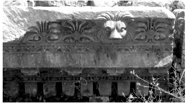
Fig. 5. Iasos (Turkey), Agora, northern portico, cornice no. 13