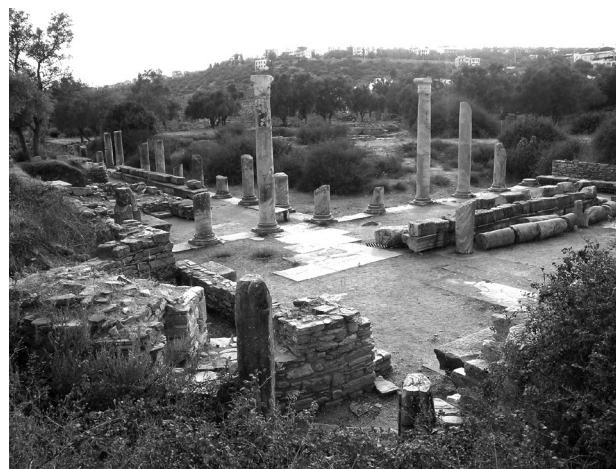
Fig. 1. Iasos (Turkey), general view of the Agora from the North-East corner

Iasos, a city on a rocky peninsula on the Gulf of Mandalya in Caria, underwent an intense building activity during the first centuries of imperial age. A new district was planned on the southern slopes of the hill and a new aqueduct was built while some of the public Hellenistic monuments were embellished, like the stage fronts of the theater and of the Bouleuterion, or completely reconstructed, like the porticoes of the central agora. In particular the reconstruction is perfectly dated between 136 and 138 AD by the inscription written on the architrave. 1