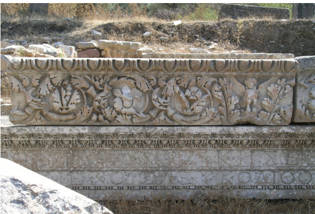
Fig. 4. Iasos (Turkey), Agora, eastern portico, frieze no. 6