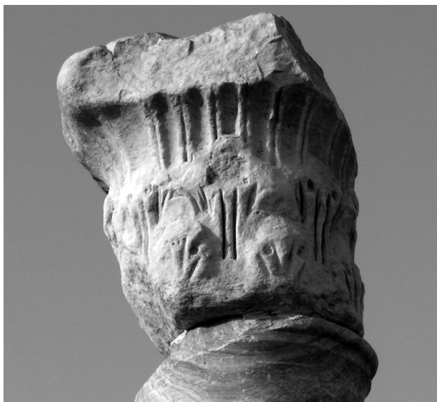
Fig. 12. Iasos (Turkey), Agora, northern portico, Corinthian capital in white marble placed on the column shaft at the North-East corner