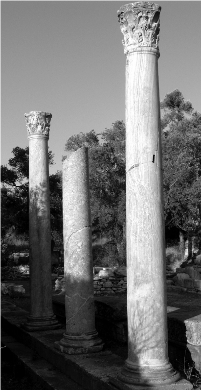
Fig. 2. Iasos (Turkey), Agora, eastern portico, column shafts (from left to right nos. 1, 3, 2)