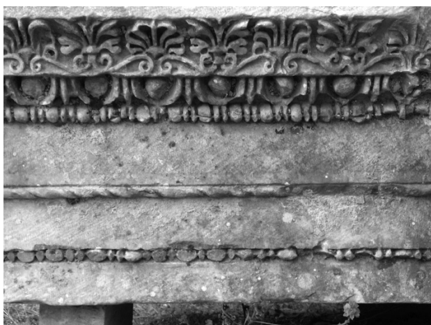
Fig. 13. Iasos (Turkey), Agora, northern portico, architrave in white marble