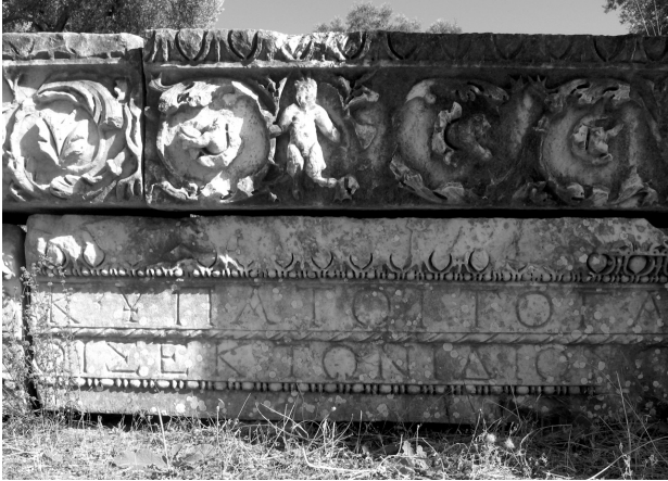
Fig. 15. Iasos (Turkey), Agora, eastern portico, frieze with peopled scrolls in white marble