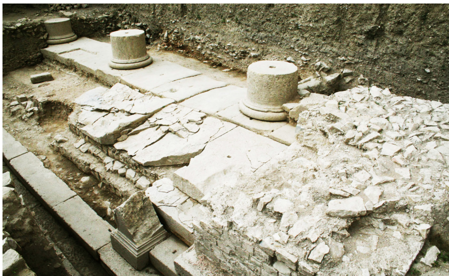
Fig. 1. Vaison-la-Romaine, Forum, stylobate and columns on the portico carved in local limestone

The quarries were situated near the city – one west of it, the Théos hill (colline de Théos), three in the south-west – Les Roussillons, Ravin de Mars, Sainte-Catherine, and one east of Vaison – by the road to Malaucène. These quarries were exploited until the 19 th century; nevertheless, due to the layer thickness (15-20 cm), they provided only small blocks. For the bigger dimension stones, a shelly limestone was imported from the quarries situated at Beaumont-du-Ventoux. These quarries, exploited until the 1950s, contained a Burdigalian limestone deposit.