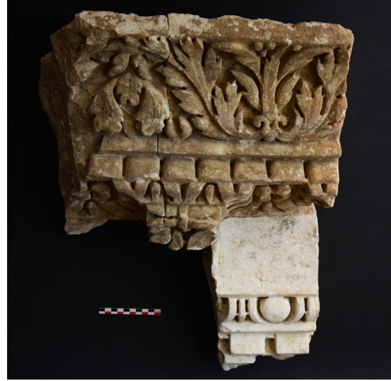
Fig. 4. Vaison-la-Romaine, Forum, cornice, white Pentelic marble

Three come from Turkey: Greco scritto 15 (near Ephesus, Turkey), Breccia pavonazzetto 16 (Afyon, Synnada, Dokimeion, Turkey) and Africano 17 (Teos, Turkey).