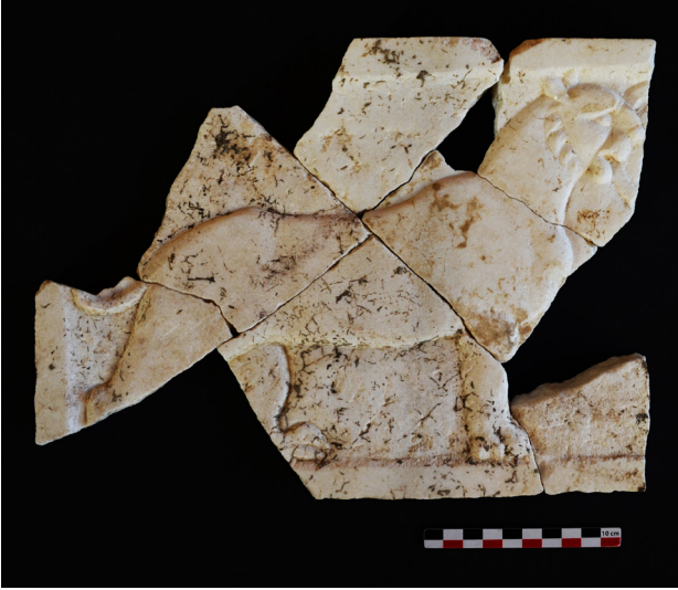
Fig. 5. Vaison-la-Romaine, Forum, the Lioness relief, white dolomitic Thassos marble

and then elements of bay decoration and a smaller architectural order, that belong to some additional architecture.