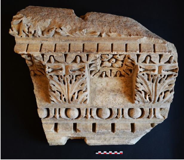
Fig. 3. Vaison-la-Romaine, Forum, cornice, white Carrara marble