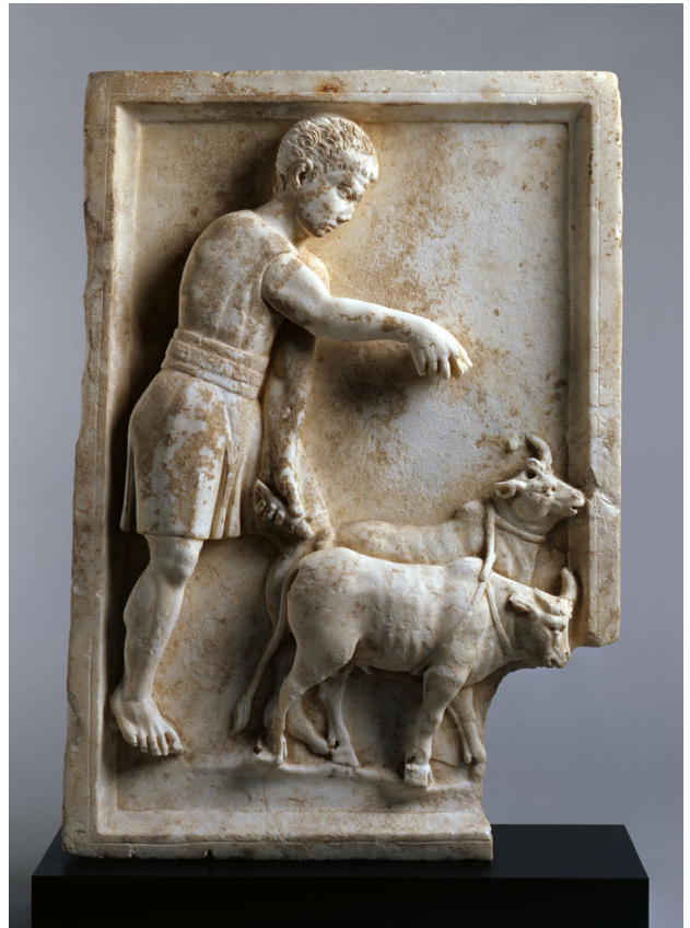
Fig. 5. Relief of a ploughman