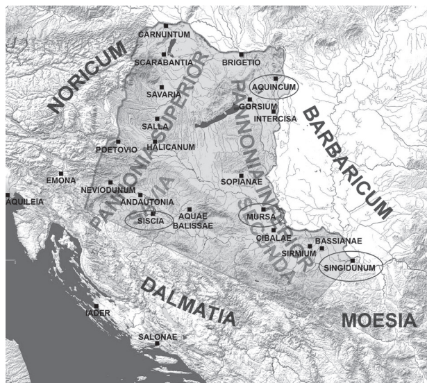
Fig. 2. Map of Pannonia (readjusted after MIGOTTI 2012, p. 2)

1. A child's sarcophagus 5 with a motif of peltae, probably dating from the 3 rd century, stems from Sisak (Fig. 1). When I first discussed it, the stone had not yet been characterised. Therefore, on realising that the ash chest was made of limestone, and not yet knowing that it was a specific variant of limestone – travertine, I suggested, in spite of some hesitation, a local production for it, for a couple of reasons. While the peltate motif is ubiquitous in Roman art, surprisingly it turned out that the lid of the sarcophagus, with its specifically shaped acroteria , was the only one of its kind in southern Pannonia; the fact that the only true analogies to this piece stem from the area of Aquincum and Brigetio in north Hungary was even more unexpected. In spite of this, I still maintained that only the model for this piece came from northern Pannonia, discarding the possibility that it was brought to Siscia from a distance of some 400 km (Budapest – Osijek – Sisak) as the crow flies. 6 Now that it has been established beyond doubt