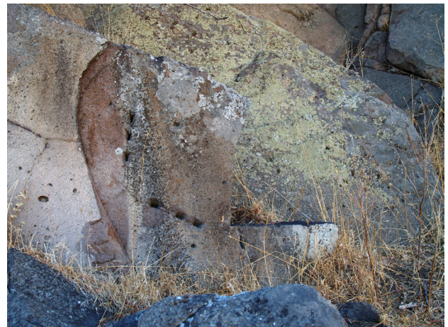
Fig. 5. Wedge-holes on a vertical rock surface before splitting in the south-eastern quarry in Larisa West

Generally, two types of splitting holes in terms of quarrying method can be identified on surfaces; narrow strip-like holes and wider-and-regularly carved holes. The narrow ones can be presented in two groups considering the length. In several cases, one single line about 20-30 cm long (or longer), 1-2 cm wide and about 3 cm deep is seen on the surface. These openings obviously served for the splitting of smaller or middle size blocks from the rock. Some of them can be considered a preliminary stage for the opening of smaller holes on the surface. On the other hand, there are hundreds of cases on site where a row of smaller rectangular holes is set into the surface of the rock to enable the splitting. These wedge holes are about 8-12 cm long, 1-2 cm wide and 3-5 cm deep (Fig. 5).