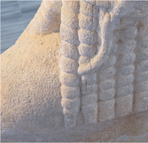
Fig. 13. Hair on the left shoulder, pricking