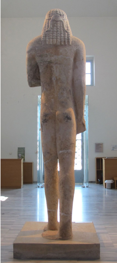
Fig. 4. Kouros, back view, Thasos 1