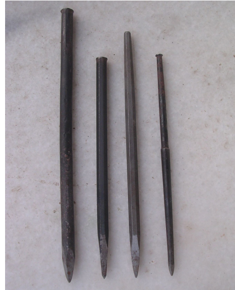
Fig. 5. Points with different sizes

the right: the work is more advanced (Fig. 12). We can also see that by observing the point marks.