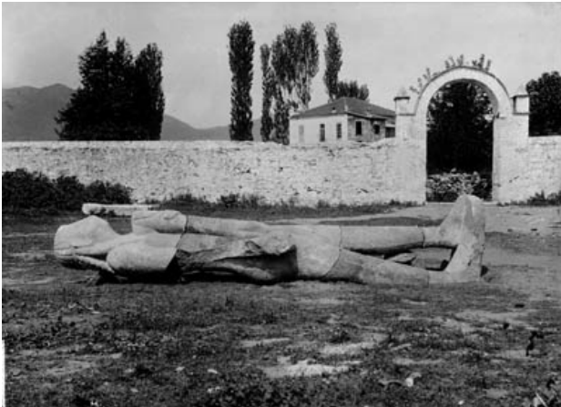
Fig. 2. Kouros reconstituted in the courtyard of the museum

Radiating from the crown of the head, the hair is arranging in long pearl locks, except on the forehead where the pearls are not yet carved. The hair is retained by a headband tied in the back and falls down on the back and on each side of the face in four parotid locks.