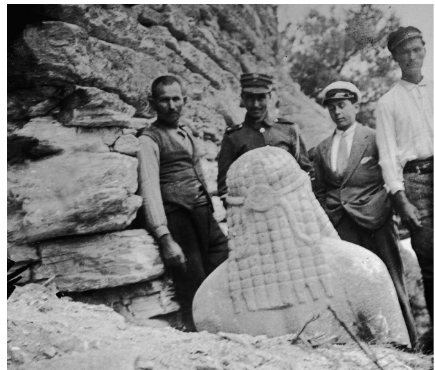
Fig. 1. Part of the kouros, after the extraction from the east wall of the Acropolis

Discovered and partially removed in 1914 by Charles Picard 2 in a medieval part of the surrounding east wall of the Acropolis, the colossal unfinished kouros from Thasos was entirely extracted in 1920 (Fig. 1). Broken in five parts – head and shoulders, torso with beginning of the legs, each leg and the feet adhering to