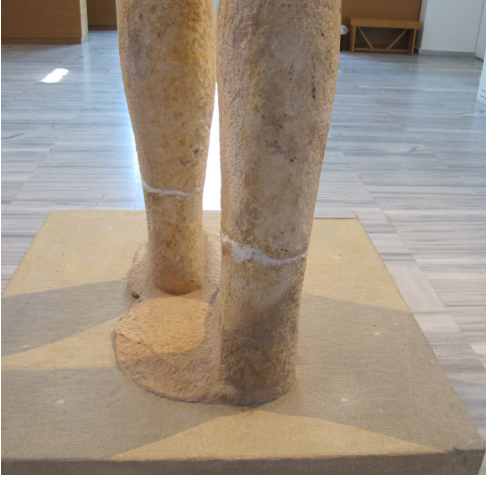
Fig. 12. Left leg thinner than the right one: more advanced work