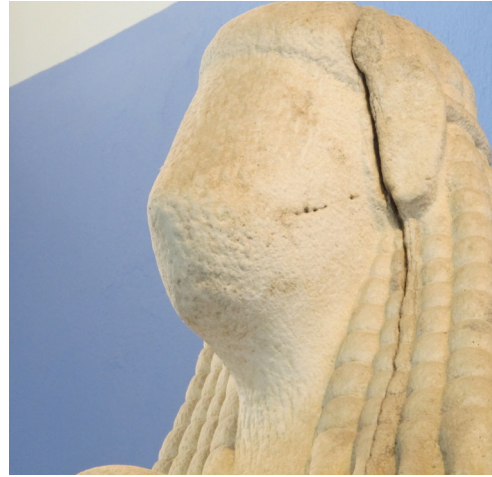
Fig. 15. Left part of the head, big crack