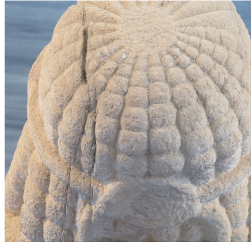
Fig. 16. Top of the head, crack on the left