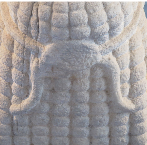
Fig. 14. Hair locks and headband bow, back view, pricking