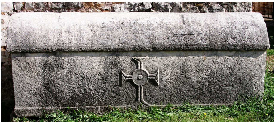
Fig. 12. Local sarcophagus with cross