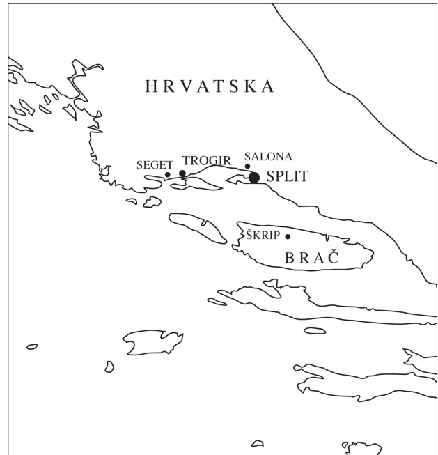
Fig. 1. Map of Central Dalmatia showing the locations of stone quarries

stone, stone quarries, sepulchral monuments, Dalmatia