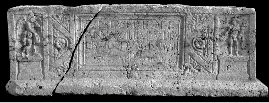
Fig. 9. An example of local Salonitan sarcophagus. Vranjic near Salona