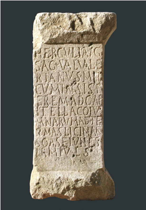
Fig. 18. Altar dedicated to Hercules island of Brač

or whether there were several. The latter seems more likely according to parallels from Brač.