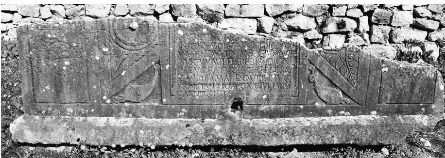
Fig. 11. Fragment of Christian sarcophagus chest

convenient for Christian burials, as they were suited to laying whole bodies to rest, as well as housing numerous bodies (Fig. 11). We have uncovered over 2000 sarcophagi and fragments to date, but this number is provisional, as there are new discoveries appearing every day.