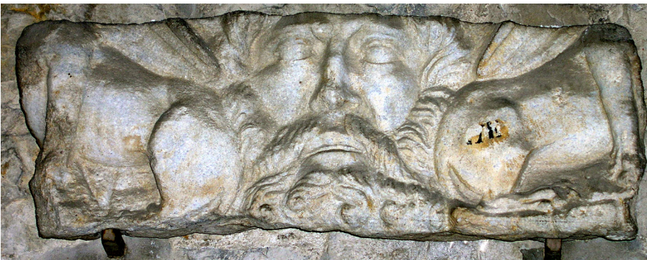
Fig. 15. Sarcophagus fragment of Carrara marble (Salona)

mythological themes, were imported from the aforementioned stoneworking centers. 14 Even though their numbers were far more limited, sarcophagi made from Carrara marble manufactured in the workshops of Rome were also represented in Dalmatia, and mostly in Salona (Fig. 15). 15 Sarcophagi from Proconnesian marble were predominantly brought to Dalmatia as roughly hewn blocks, which were then finished on the spot. 16