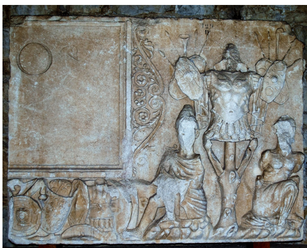
Fig. 7. Roman military tropaeum from Gardun

on their own 9 . Accompanying the soldiers that served in Dalmatia, who were stationed in legion camps (Burnum and Tilurium) at the start of the 1 st century, came monumental and richly decorated monuments, which often featured military symbolism and tools (Fig. 6).