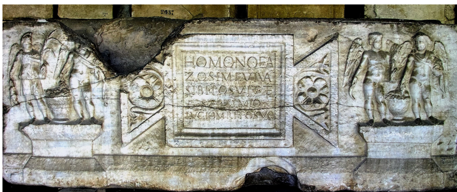
Fig. 13. A sarcophagus chest of Proconnesian marble Salona

and simple cover with four acroteria or cylindrical lid (Fig. 12). They featured several types of crosses. 11