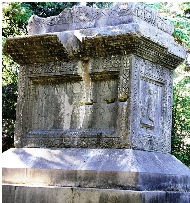
Fig. 8. Ara of Pomponia Vera from Salona

During the 1 st century, the repertoires of the workshops that produced these funerary monuments were broadened with the addition of other funeral monuments, with the most numerous among them originating from cult sacrificial altars. The leap from altar to funeral monument of a similar shape is not that great, as the grave were locus religiosus , upon which sacrifices were offered for the deceased, or more specifically, for the gods of the underworld, which led to the introduction of the inscription D(is) M(anibus) at the end of the 1 st century (Fig. 8).