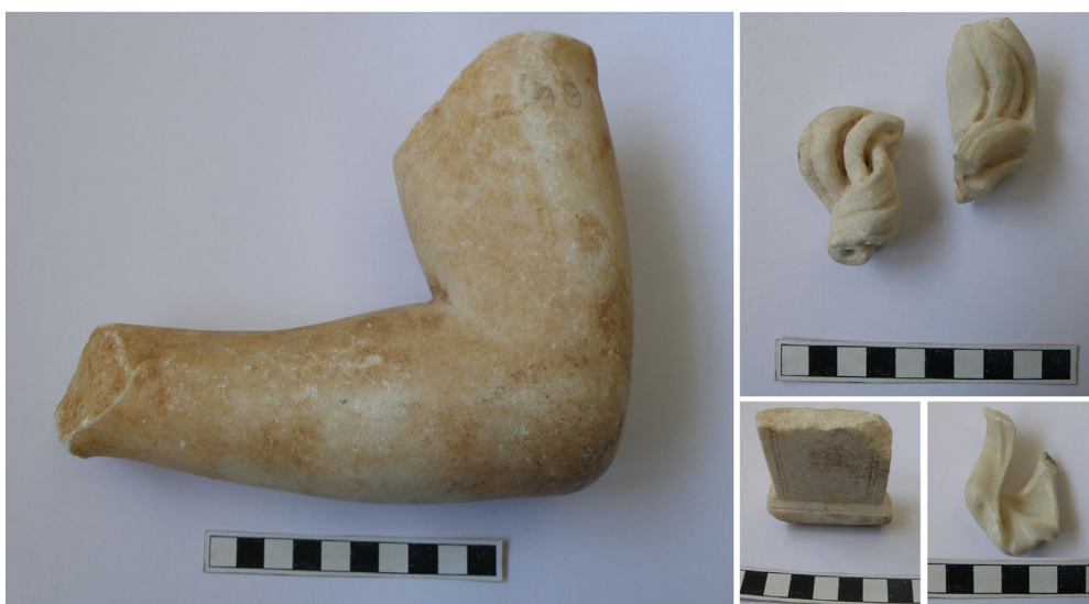
Fig. 5. Part of an arm, parts of curls and a small aedicula with holes for mounting. White marble

overlap like scales, with a triangular space between the leaves filled with three berries on one of the fragments. He also found a twisted marble pillar with an elliptical cross-section, which was decorated with leaves on its much damaged lower part. 18