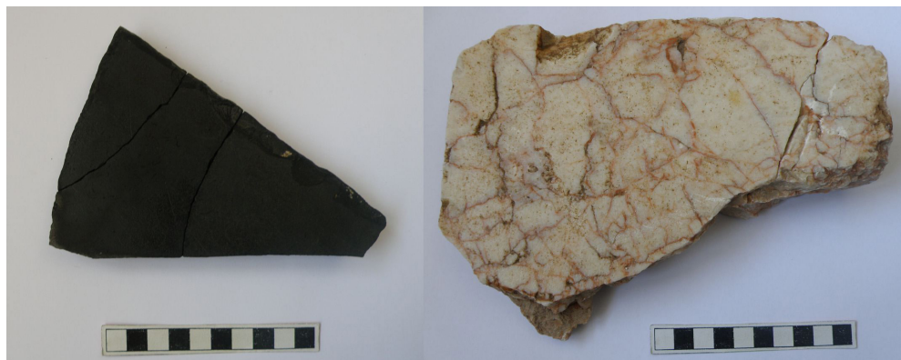
Fig. 4. Black limestone slab, and breccia corallina slab