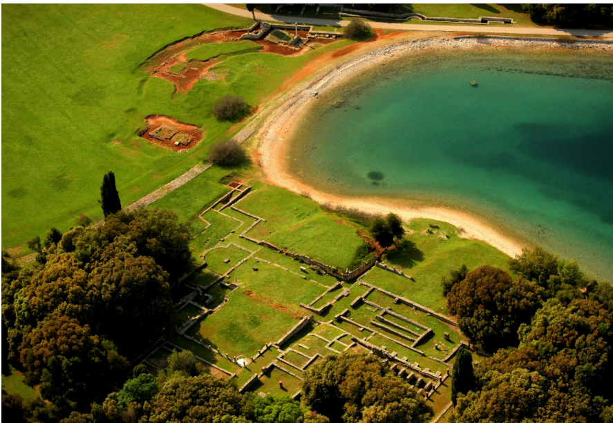
Fig. 2. Aerial view of the three-terrace villa and the temple area

a big chain that stretched between the two opposite shorelines, after which the bay itself was named (a chain is called verige in Croatian).