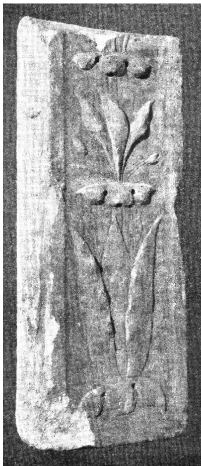
Fig. 3. Pilaster made of white marble, from room XIII

when “giallo africano” and “pavonazzetto” were mentioned for the first time as types of marble found in the thermae , the descriptions of the marble material that Gnirs left us were limited to its colour and sometimes dimensions.