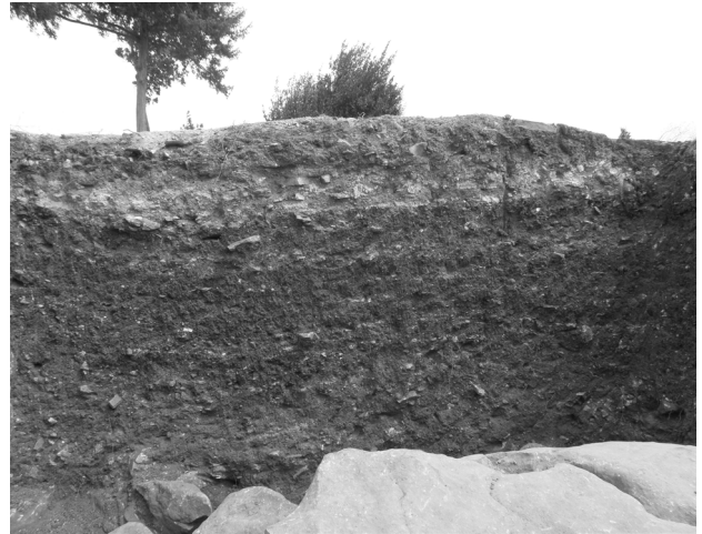
Fig. 4. Infill of grikes for the purpose of levelling the surface prior to construction works

northwestern periphery where the Legio XI CPF soldiers built an amphitheatre and other military buildings. 4