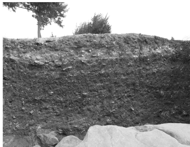
Fig. 4. Infill of grikes for the purpose of levelling the surface prior to construction works

widened cracks between grikes in the lower section of doline slopes were modified so as to function as drainage channels. Although the auditorium was in very poorly preserved state, the construction method and the seating rows were documented. It is hypothesised that the capacity of the Burnum amphitheatre was suitable for six or more thousand spectators.