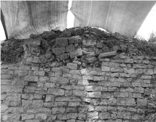
Fig. 3. Use of local tufa and marly limestone as a construction materials in the amphitheatre

widened cracks between grikes in the lower section of doline slopes were modified so as to function as drainage channels. Although the auditorium was in very poorly preserved state, the construction method the the seating rows was documented. It is hypothesised that the capacity of the Burnum amphitheatre was suitable for six or more thousand spectators.