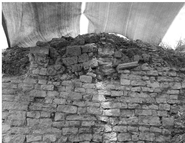
Fig. 3. Use of local tufa and marly limestone as a construction materials in the amphitheatre