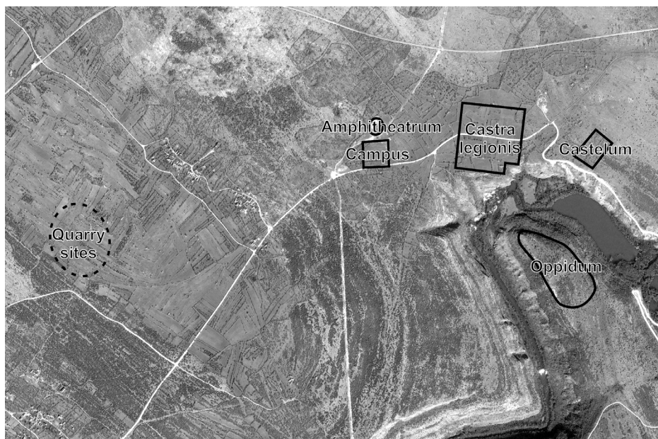
Fig. 6. Location where there were quarries of bedded marly limestone in antiquity

The surrounding plain in the wider area of the Burnum amphitheatre is built of Paleogene age carbonates. North of the site is an axis of an anticline in the northwest-southeast direction. A limited area around the amphitheatre consists of Eocene and Oligocene carbonate conglomerate with thin beds of limestone. It is surrounded by Eocene and Oligocene bedrock, which comprise limestone conglomerate, breccia and layers of marl (GRIMANI et al. , 1966, 36). Throughout our survey relatively thick layers of marly limestone were identified only in a few isolated strata.