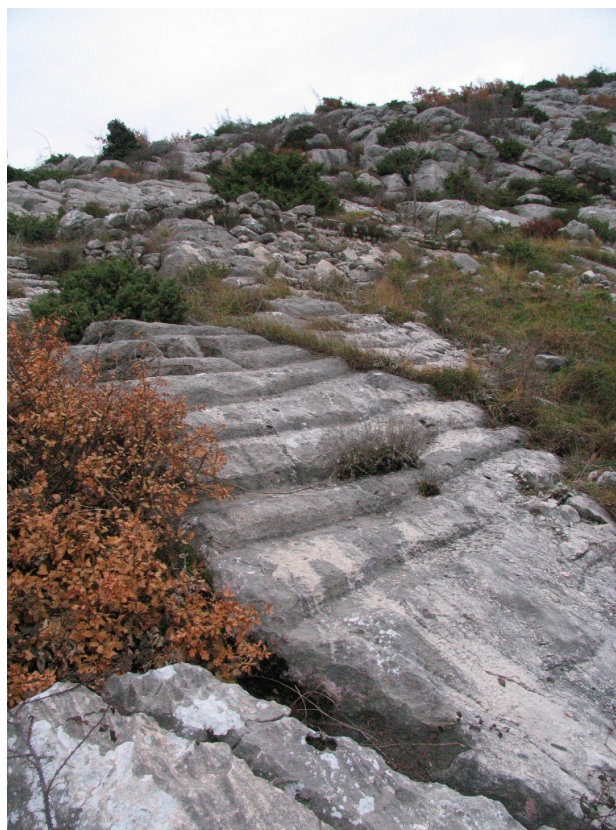
Fig. 6. Steps carved in stone

as augur in another inscription from Salona and indirectly through the inscription of one of his freedmen. 14