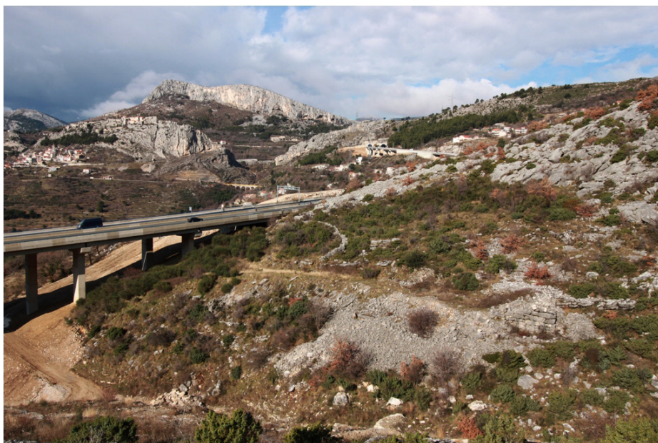
Fig. 2. View onto the site from the south

great-grandson of Gneus, from the Tromentina tribus , Clemens, city councillor and priest) 1 .