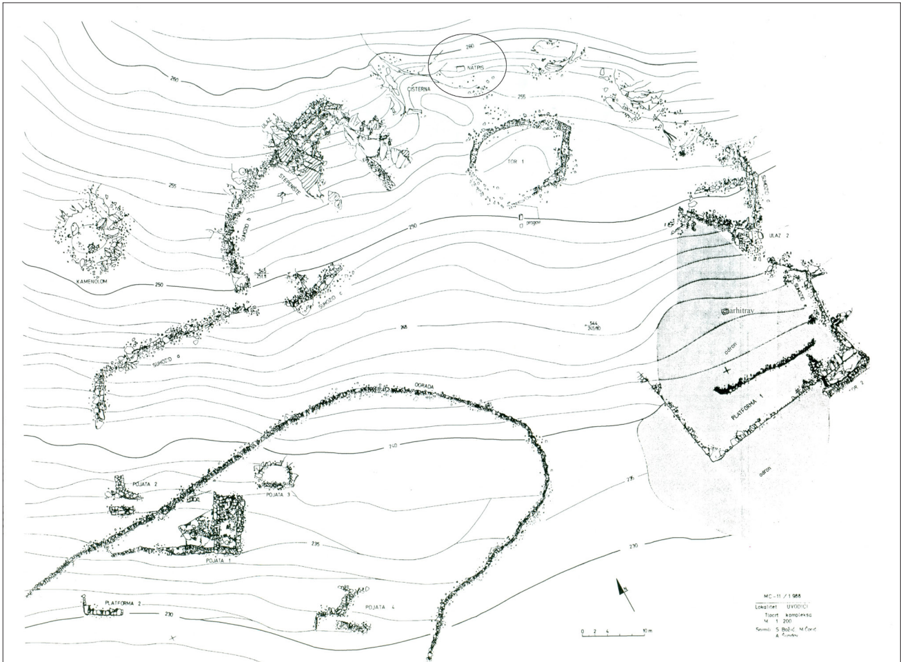
Fig. 3. Plan of the site (S. Božić, M. Čorić, A. Šundov)

parts of the Capitolium, parts of the city aqueduct. 10 Such blocks can be easily extracted from the slopes of Mosor near Klis Kosa; alongside “ordinary” limestone, they are found on the surface and break off into regular shapes, most often in the form of elongated plates or blocks which then require minimal processing. 11 Inscription of L. E. CLEMENS dates back to the time when the largest number of the mentioned buildings were erected in Salona, in the construction of which such large blocks were used. Can we therefore assume that in this complex there are the remains of dwellings and workshops of stonecutters in which they also had a shrine dedicated to Jupiter? The stone blocks excavated there were used almost exclusively as building material because this stone is not suitable for architectural decoration. In support of this