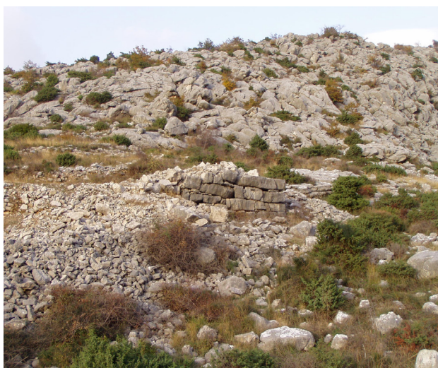
Fig. 5. Southern part of the site with drystone wall of large blocks

the cliff is interrupted by elongated steps/channels that probably collect rain water for the cistern.