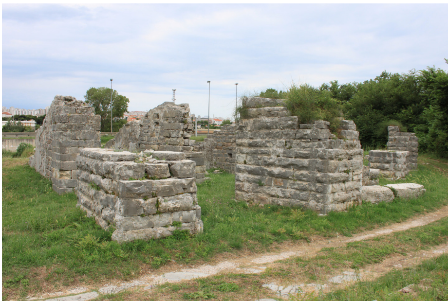
Fig. 7. Part of the Roman theater in Salona built with large blocks of stone

Salona had a guild, or perhaps several guilds, ( collegia ) of stonecutters. One of the inscriptions mentions “(co) llegium (la)pidarior(um) ”. 18