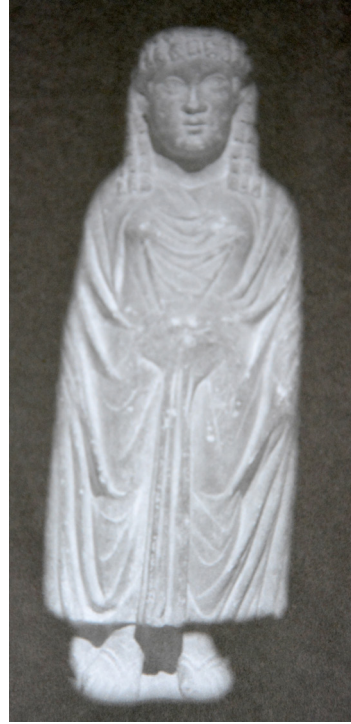
Fig. 9. Former Graeco- Roman Museum, Isis (SAVVOPOULOS, BIANCHI 2012, 161)

maybe belonging to the lararium of the domus 22 (Fig. 9).