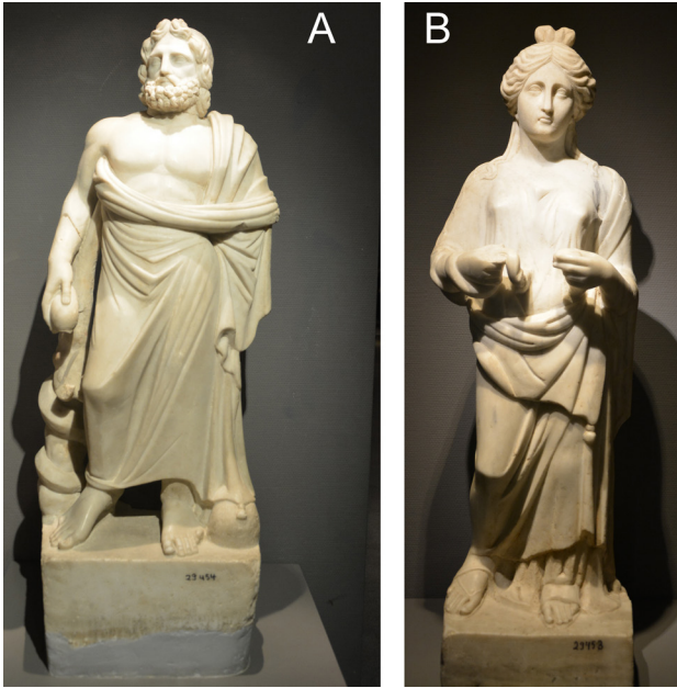
Fig. 5. Bibliotheca Alexandrina Antiquities Museum, A Asclepius; B Hygeia