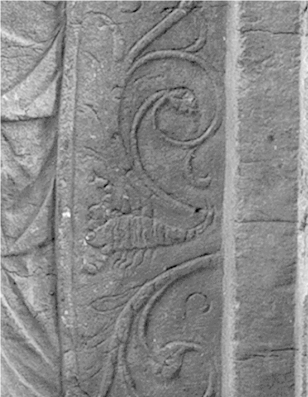
Fig. 3. Detail, Shield Emblem of Scorpion on Relief Panel, from Puteoli, University of Pennsylvania Museum of Archaeology and Anthropology, Philadelphia, MS 4916

a member or members of the Praetorian Guard, the elite protectors of the emperor, identified by their emblem, the scorpion, on the shield of one of the figures (Fig. 3). On the left edge of the panel is half of a figure in relief, marching to his right, wearing a short tunica , a paenula , and heavy sandals or caligae . He holds a spear in his left hand which leans against his left shoulder, passes by the back of the head of the figure behind him and ends at the top frame. We know that at least one more block would have been joined to the left side of this panel to complete this one figure.