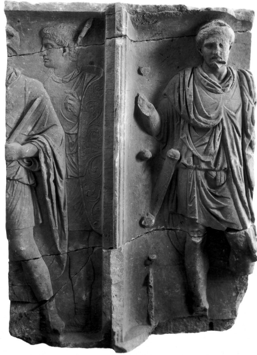
Fig. 2. Relief Panel with Roman Soldiers (Side B), from Puteoli. University of Pennsylvania Museum of Archaeology and Anthropology, Philadelphia, MS 4916

a notable exception, making it an especially important document for Roman history. The inscription was not destroyed but “erased,” using a chisel to carefully pick out the 11 lines, but it is still possible to read each line with a raking light. The inscription can be closely dated by historical information, including the death and so-called damnatio memoriae of Domitian, and by imperial titles, especially the reference to his 15 th tribunician year, to between September AD 95 and September AD 96.