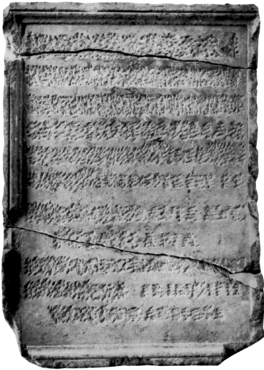
Fig. 1. Panel with Domitianic Inscription (Side A), from Puteoli. University of Pennsylvania Museum of Archaeology and Anthropology, Philadelphia, MS 4916