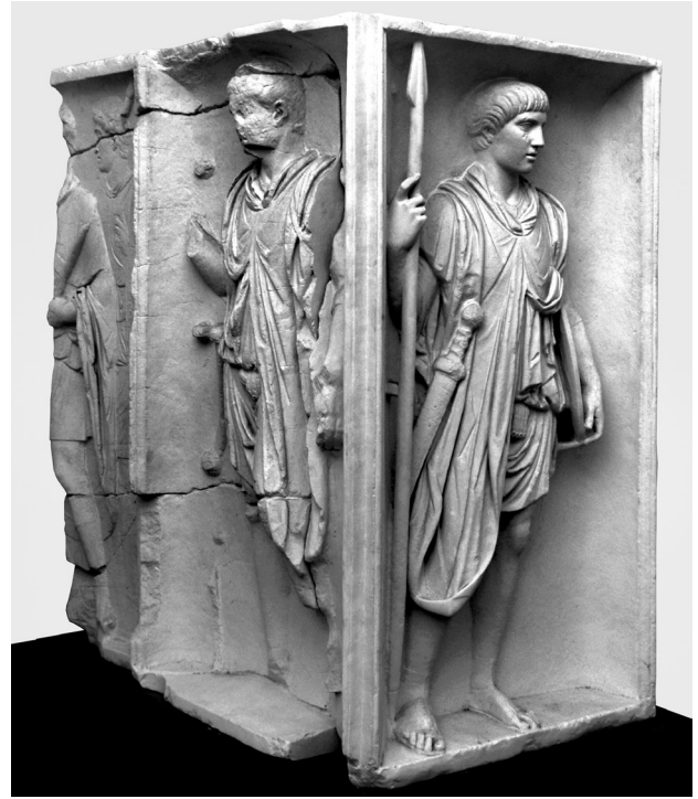
Fig. 6. Plaster Casts of the Joined Puteoli Panels in Philadelphia and in Berlin in the Museo dei Campi Flegrei, Baia

of the rightmost figure on the Penn panel is down, supporting a small oval shield ( palma ) at his left side (Fig. 5). This corner of the monument probably had a molded frame, but conservation of the panel carried out in 2009 shows that the present molding was reconstructed in the 19 th century (personal communication, Wolfgang Massmann, Antikensammlung conservation records, June 2013). In high relief in a frontal pose is a single soldier wearing a tunica , paenula , cingulum , and caligae , with a gladius hanging at his right side and a small oval shield, a palma , at his left. The viewers' right side of the panel is carefully finished, with a large ancient dowel cutting and pour channel from the top of the block and with 3 cm wide finely-picked contact bands at the front and back edges, all from the block's previous use. It is not clear, therefore, if another relief panel was attached at this edge. The back of this panel seems to have been sawed off in