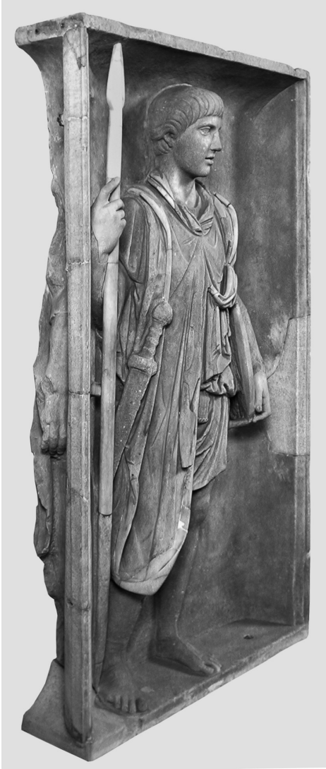
Fig. 5. Oblique View of Viewers' Left Side of Relief Panel, from Puteoli. Neues Museum, Antikensammlung, Staatliche Museen, Berlin, Sk 887

of the rightmost figure on the Penn panel is down, supporting a small oval shield ( palma ) at his left side (Fig. 5). This corner of the monument probably had a molded frame, but conservation of the panel carried out in 2009 shows that the present molding was reconstructed in the 19 th century (personal communication, Wolfgang Massmann, Antikensammlung conservation records, June 2013). In high relief in a frontal pose is a single soldier wearing a tunica , paenula , cingulum , and caligae , with a gladius hanging at his right side and a small oval shield, a palma , at his left. The viewers' right side of the panel is carefully finished, with a large ancient dowel cutting and pour channel from the top of the block and with 3 cm wide finely-picked contact bands at the front and back edges, all from the block's previous use. It is not clear, therefore, if another relief panel was attached at this edge. The back of this panel seems to have been sawed off in