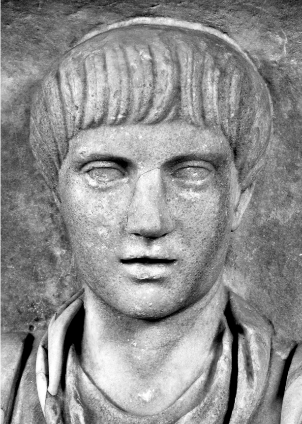
Fig. 7. Detail, Head of Soldier, Relief Panel from Puteoli, Berlin SK 887

and in profile, separated from the frontal figures in high relief at the corners, may be a clue to understanding the monument.