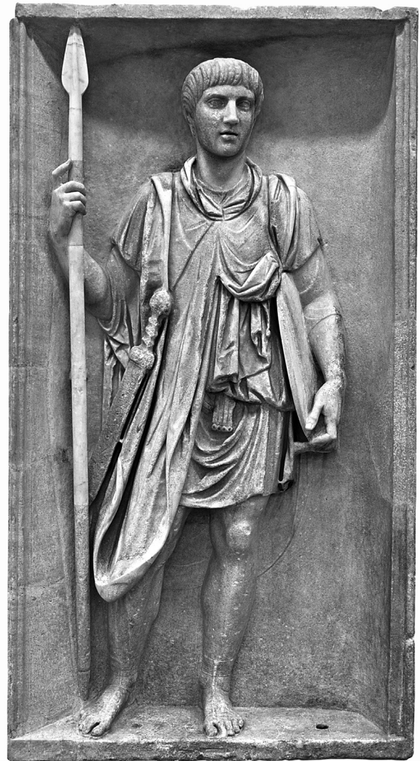
Fig. 4. Relief Panel, from Puteoli. Neues Museum, Antikensammlung, Staatliche Museen, Berlin, Sk 887, post-conservation, 2013

On the viewer's right is a figure in high relief, separated from the other two figures by a vertical molded frame. The background curves in deeply from the central