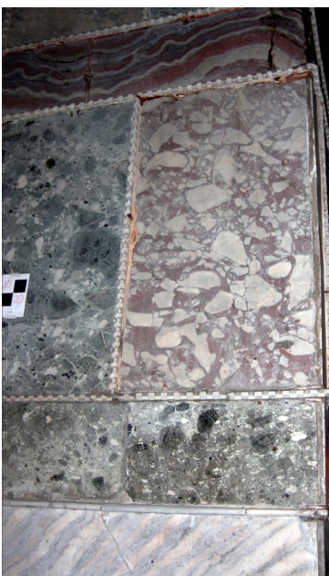
Fig. 7. Hagia Sophia, main pier, rosy breccia panel (Lydian marble?); surrounded by Atrax marble ( verde antico ) and Iasian marble ( cipollino rosso )