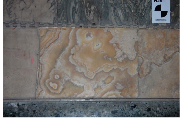
Fig. 3. Hagia Sophia, nave piers, onyx band; at center and right, Egyptian alabaster; at left, white marble?

a geographical origin for “onyx”, although this yellow-brown, white-banded travertine can be clearly identified in the building (Figs. 3-6). The onyx or alabaster may have multiple geographic origins, making a simple definition impossible. The stone has been called both Cappadocian (GNOLI 1988, 45, note 6, 220-221) and Egyptian (SCHIBILLE 2014, 103, 243). Either identification could be correct. The onyx in the building displays a great variety of color and pattern; it ranges from brown to reddish brown to orange to honey-colored to yellow to white, and it may display elaborate cloud-patterns, mild veining, or bland, uniform fields. Much of it is honey-colored with white bands and seems compatible with an Egyptian origin (Fig. 3) (KIILERICH 2012, Fig. 4; http://www.stonecontact.com/products-216005/aalabaster-onyx-slabs-tiles ). Turkey itself has many quarries of alabaster/onyx/travertine. Those at Thyatira, Lydia (ÇOLAK, LAZZARINI 2002) and Hierapolis (BRUNO M., 2002) were demonstrably used in antiquity, but the surviving material there does not seem to match the