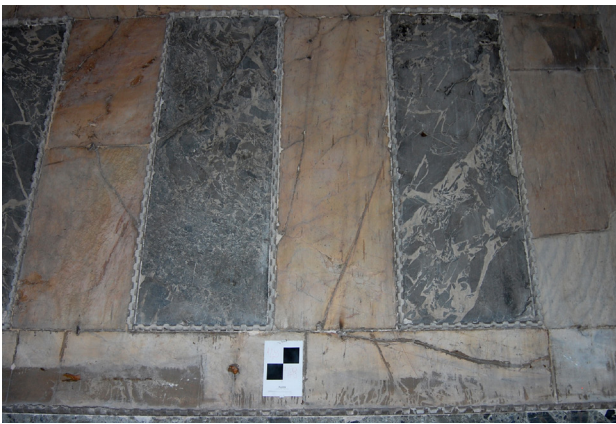
Fig. 2. Hagia Sophia, narthex, “Mauretanian/Libyan” marble ( giallo antico ) surrounding panels of “Celtic” marble ( bianco e nero antico )

a geographical origin for “onyx”, although this yellow-brown, white-banded travertine can be clearly identified in the building (Figs. 3-6). The onyx or alabaster may have multiple geographic origins, making a simple definition impossible. The stone has been called both Cappadocian (GNOLI 1988, 45, note 6, 220-221) and Egyptian (SCHIBILLE 2014, 103, 243). Either identification could be correct. The onyx in the building displays a great variety of color and pattern; it ranges from brown to reddish brown to orange to honey-colored to yellow to white, and it may display elaborate cloud-patterns, mild veining, or bland, uniform fields. Much of it is honey-colored with white bands and seems compatible with an Egyptian origin (Fig. 3) (KIILERICH 2012, Fig. 4; http://www.stonecontact.com/products-216005/aalabaster-onyx-slabs-tiles ). Turkey itself has many quarries of alabaster/onyx/travertine. Those at Thyatira, Lydia (ÇOLAK, LAZZARINI 2002) and Hierapolis (BRUNO M., 2002) were demonstrably used in antiquity, but the surviving material there does not seem to match the