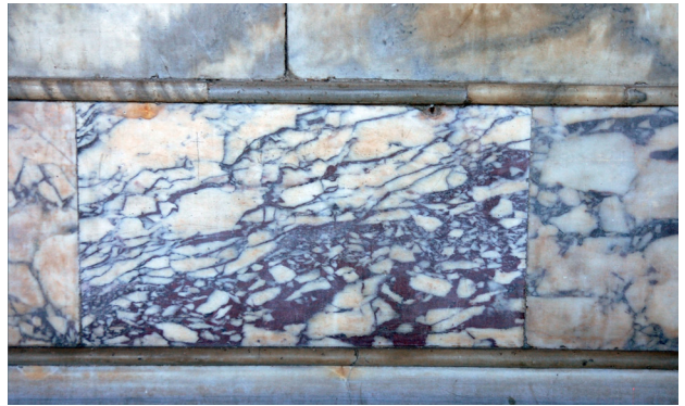
Fig. 9. Hagia Sophia, narthex gallery, bluish and reddish Phrygian marble ( pavonazzetto )