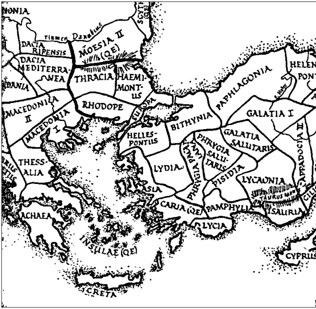
Fig. 11. Justinian's provinces. From JONES 1964, 1451, map 6

to be present on the walls of Hagia Sophia. Lorenzo Lazzarini has identified it in a roundel (which is not currently visible) in the pavement (LAZZARINI 2002, 64, Fig. 14), but the roundel probably stemmed from a 14 th century Cosmatesque-style addition. The stone, in fact, seems to be very rare in Constantinople in general. Lazzarini could identify only one other example, a column shaft in Hagia Irene (LAZZARINI 2002, 64, Fig. 14). Not only is breccia corallina from Vezirhan absent from the sixth-century structures of Hagia Sophia, but it also is unlikely that the stone ever had a significant presence there. The church's paneling is complete enough for it to be said that there is really no place for it. Much of the marble paneling of the outer walls of the side aisles has been replaced with painting, but it is hard to believe that the Silentiary would have put so much emphasis on a marble confined to this peripheral position. Furthermore, Vezirhan lies in Bythynia across the Bosphorus from Constantinople (Fig. 11), and it is hard to believe Paul would have placed it in Lydia.