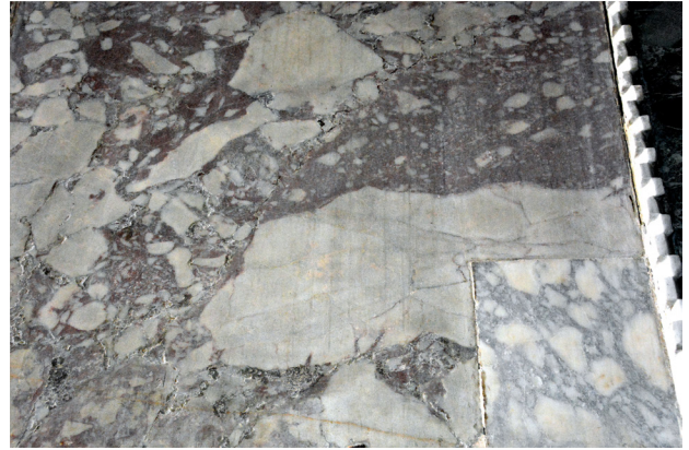
Fig. 8. Hagia Sophia, main pier, rosy breccia panel (Lydian marble?) with Phrygian marble ( pavonazzetto ) patch