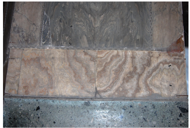
Fig. 4. Hagia Sophia, nave pier, alabastro fiorito (from Hierapolis?); above, Carystos marble ( cipollino ); below, Atrax marble ( verde antico )

Hagia Sophia onyx closely. The Silentary speaks of the onyx of Hierapolis in his description of the ambo (pulpit) of Hagia Sophia, but he makes no mention of it in the building proper (PAUL SILENTIARY, Descr. Amb. 76-104: GNOLI 1988, 46-48). Some panels, however, seem to be the more reddish alabastro fiorito ascribed to Hierapolis/Pamukkale (Fig. 4); compare examples in the Corsi Collection at Oxford (slab 316) ( http://www.oum.ox.ac.uk/corsi/stones/view/316 ). Some of the variety at Hagia Sophia could be due to 19 th century repairs; the onyx friezes contain several slabs of whitish or yellow and white banded marble (rather than layered travertine), and at least one slab appears to be yellow and black giallo di Siena and thus probably from the 19 th century restorations (Fig. 5). At least some of the pieces of alabaster used in sixth-century Hagia Sophia must have been second-hand since some onyx panels have moldings (Fig. 6), but most do not. The inclusion of multiple onyxes and reused stones may have contributed to the Silentary’s reticence about the origin of the onyx.