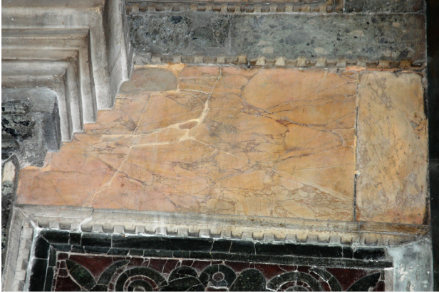
Fig. 1. Hagia Sophia, to left of main entrance in nave: above, “Mauretanian/Libyan” marble ( giallo antico brecciato ); below, intarsia panel of Laconian ( serpentino ) and Egyptian porphyry