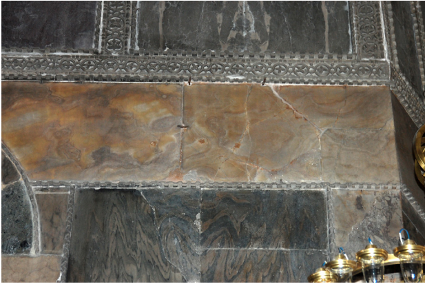
Fig. 5. Hagia Sophia, nave pier: left, giallo di Siena marble; right, onyx; below, Carystos marble ( cipollino )