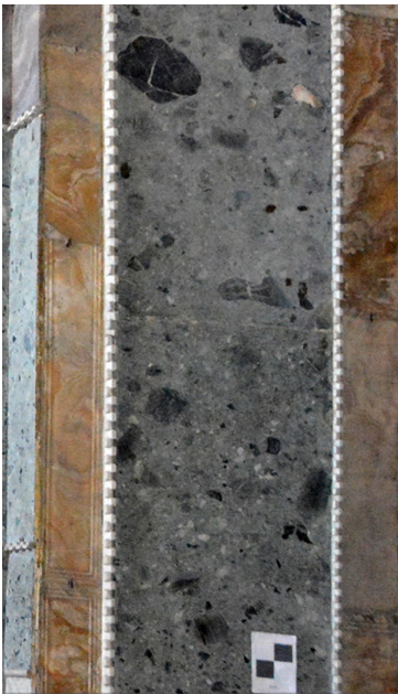
Fig. 6. Hagia Sophia, SW main pier, Atrax marble ( verde antico ) framed by panels of alabastro fiorito (from Hierapolis?) and reused panels with moldings