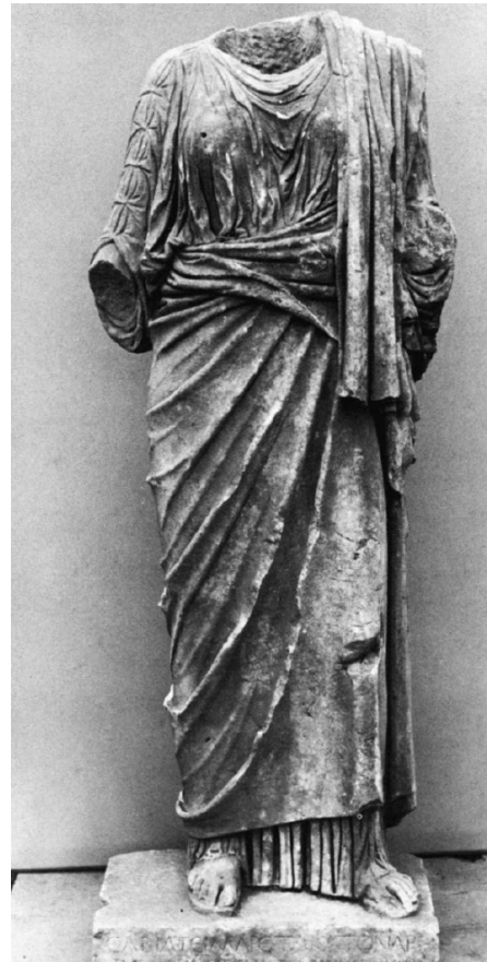
Fig. 8. Kore of the Torlonia-Hierapytna type, marble from Cape Vathy, Thasos, early Antonine? Cyrene Museum, inv. 77-940, from the Extramural Sanctuary of Demeter and Kore

Cyrene has another head of the Velletri Athena, which is again colossal (height 51 cm) but otherwise very different. Enrico Paribeni has characterized it as rough and provincial (Fig. 7). 14 Cyrene generally has sophisticated sculpture and lacks rustic works directly comparable to this. The sharply chiseled locks, the complete lack of drill-work, and the symmetrical, pointed oval