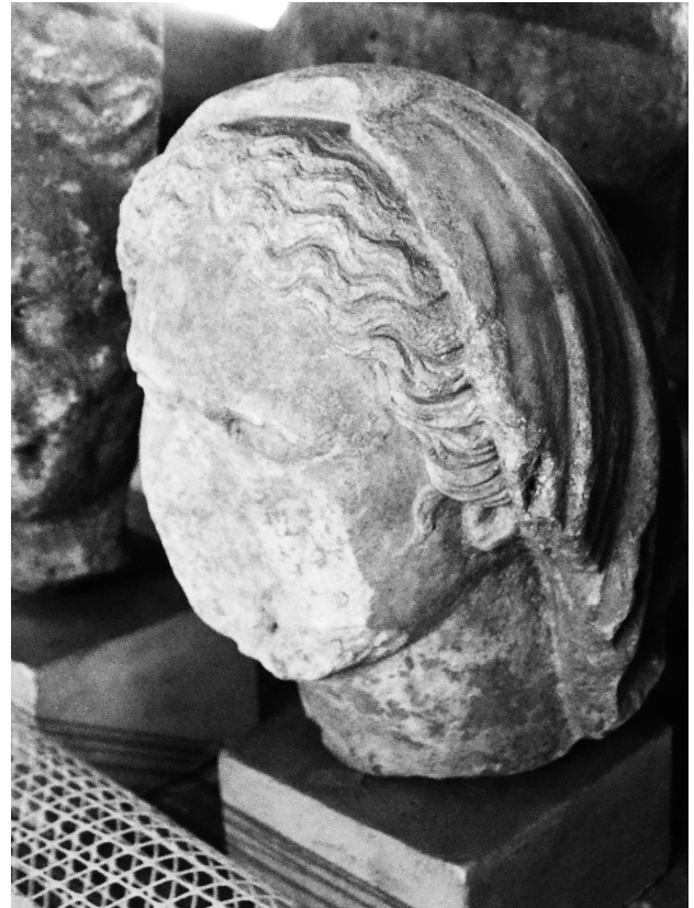
Fig. 4. Head of a woman, probably marble from Cape Vathy, Thasos, late first century BCE? Thasos Museum

Thasos. 4 Two more colossal replicas of the Velletri Athena are also made of Thasian marble; one is in Rome and another in New Haven, Connecticut. 5 Evelyn Harrison lists 16 colossal examples of the Velletri type, 6 and the new Cyrene piece makes a total of 17. The four proven Thasian pieces make up 23.5% of the total, which is far above the usual Thasian percentage of 4% of a given group of statues. Christa Landwehr has dated the colossi as a group to Augustan times. 7 There clearly was an unusually strong inclination to use Thasian marble for this subject. Its pure white color was probably one of the attractions, but the question remains why Thasian dolomite was especially popular in the particular case of the Velletri Athenas.