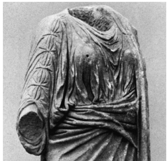
Fig. 9. Kore of the Torlonia-Hierapytna type, marble from Cape Vathy, Thasos, early Antonine? Cyrene Museum, inv. 77-940, from the Extramural Sanctuary of Demeter and Kore