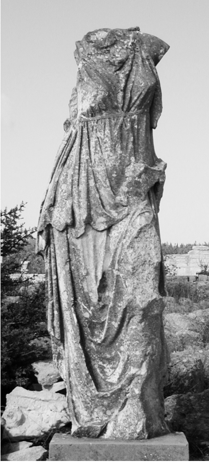
Fig. 15. Ariadne, marble from Cape Vathy, Thasos, first century, Cyrene