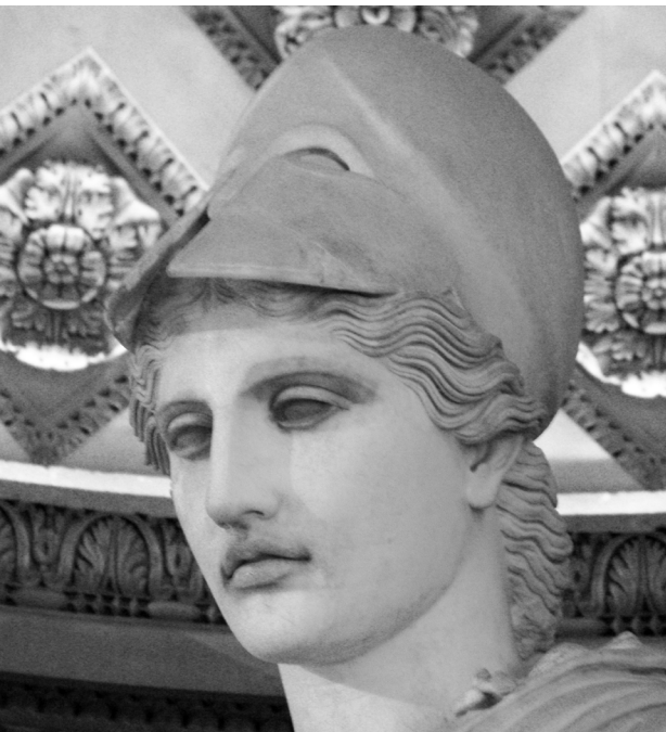
Fig. 2-3. Athena from Velletri, marble from Cape Vathy, Thasos, Augustan, Louvre