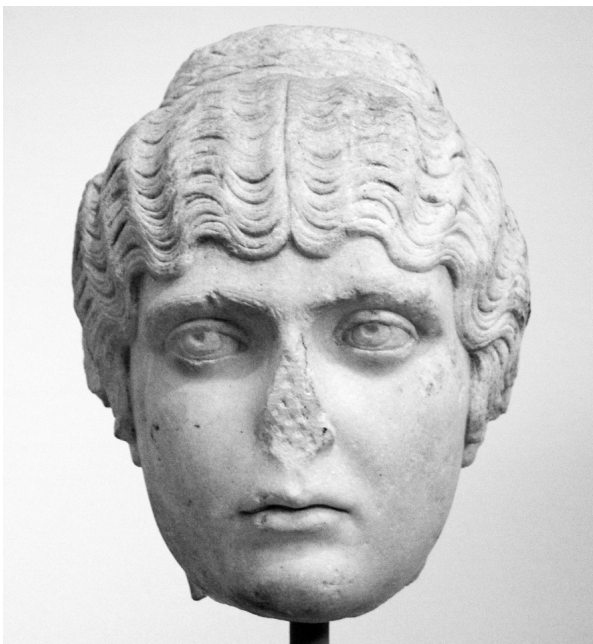
Fig. 14. Portrait of Faustina the Younger, found in Athens, marble from Cape Vathy, Thasos, ca. 147-150 CE. National Archaeological Museum, Athens, inv. 442

marble (Fig. 14). 22 Pavlina Karanastasi has brought out the strong sculptural similarities between Cretan and North African sculpture in Roman times, 23 and this group of sculptures in Thasian marble from Crete and Cyrene establishes more specific points of connection. Members of these “Thasian-friendly” workshops could plausibly have passed from Athens to Crete to Cyrene, ordering blocks of Thasian marble for specific commissions.