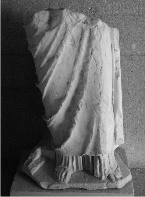
Fig. 10. Nemesis of the Torlonia-Hierapytna type, probably Pentelic marble, 2 nd century, from the west end of the Forum, Corinth, Corinth Museum, S-427

(lens-shaped) eyes are entirely compatible with many simple and rustic sculptures in the Thasos Museum. Although the marble type is unknown, it seems possible that this is a work by a sculptor from Thasos who lacked not only talent but also training in Athens.