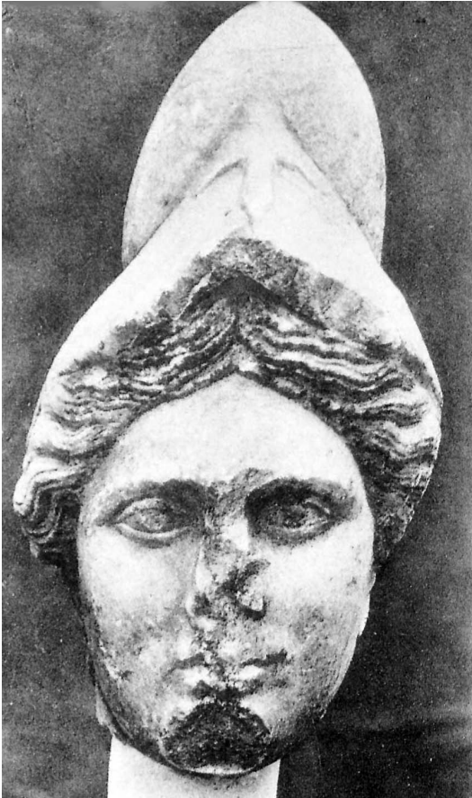
Fig. 7. Head of Athena, Velletri type, marble unknown, Cyrene Museum, inv. 14.180

seems evident that the Athena in Cyrene represents a distinctive “Eastern” or Greek approach within the Velletri group, and it probably was carved by a workshop connected with Athens that was active not only in Cyrene but also in the nearby province of Crete. The emphatic, metallic, Classicising style of the Athena in Cyrene and the Cretan portrait also has a parallel on Thasos in the head of Alexander. 13 It is even plausible that the Cyrene Athena and the Cretan portrait were carved by a sculptor from northern Greece who had a period of training in Athens.