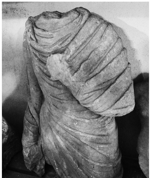
Fig. 19. Statuette of a youth (ephebe) wrapped in his chlamys, marble probably from Thasos, Late Hellenistic or Early Imperial (?). Thasos Museum