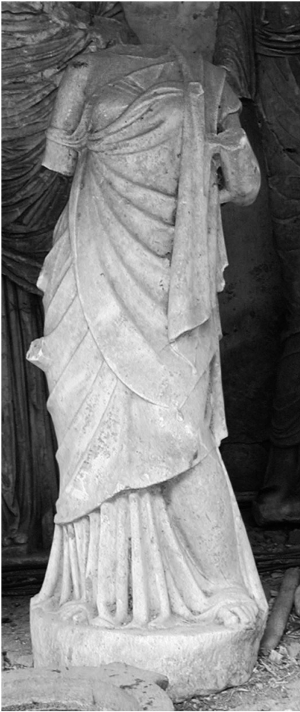
Fig. 17. Statuette of Thalia, muse of comedy, marble from Cape Vathy, Thasos, first century? Cyrene Museum, inv. 78-700, from the Extramural Sanctuary of Demeter and Kore