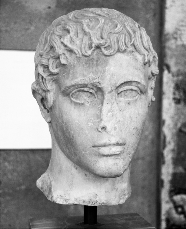
Fig. 5. Head of a youth, probably Pentelic marble, Corinth Museum, S-425

replicas were diffused. The great size of these sculptures raises the possibility that they were largely shaped in the quarries, as was the case with other colossal statues, such as the Dacian Prisoners from the Docimium quarries. 8 The actual carving of the examples of the Athena Velletri from Italy, however, was evidently performed in Italy itself, the sculptors working from plaster casts; fragments of casts of the Velletri Athena and other famous types have been found at Baia on the Bay of Naples. 9 As well as for its whiteness, Thasian marble may have been favored for these colossal statues because large blocks were relatively available on Thasos and because these statues were luxury productions. The colossal Velletri Athenas were high quality works of exceptional size, for which the added effort and (presumably) expense of carving the hard Thasian dolomite would have been a less significant obstacle than usual. The Athenian connection might also have played a role in the choice of marbles; many of the Velletri Athenas have been identified by eye as Pentelic, the marble most closely associated with Athens. Thasos could have been considered an associated or, at least, a similarly Greek marble source.