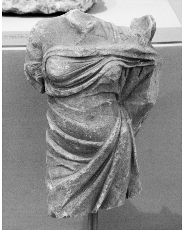
Fig. 18. Statuette of Aphrodite with Eros (?) on her shoulder, marble probably from Thasos, late Hellenistic or Early Imperial (?). Thasos Museum

In all cases there is some chance that a workshop with a special link to Thasos was involved in finishing the statue. In the case of the Athena and the Kore, a workshop travelling from Athens to Crete to Cyrene could have carved the