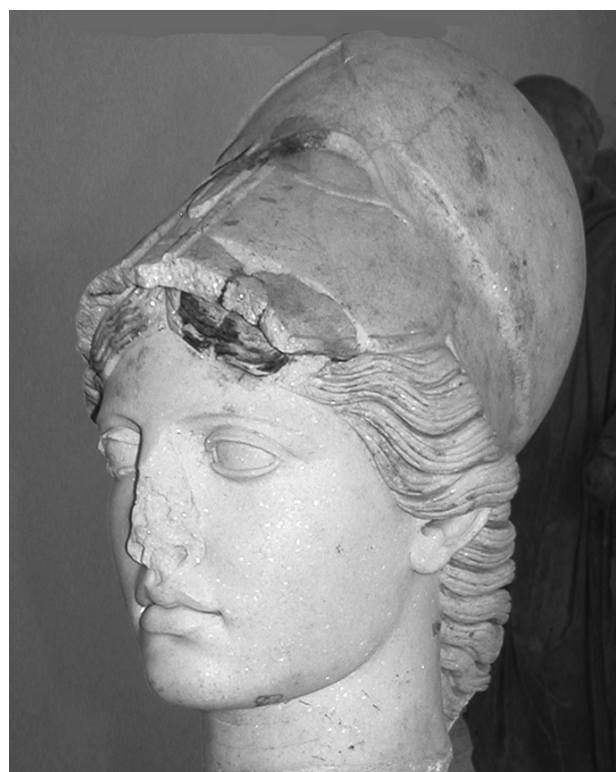
Fig. 1. Head of Athena of the Velletri type, marble from Cape Vathy, Thasos, first century CE, Cyrene Museum

Coarse-grained dolomitic marble from Thasos tends to be rare everywhere outside of its own northern Aegean neighborhood, and in distant markets was rarely used for reliefs or architectural ornament. It was used for about 4% of the statues, statuettes, and sarcophagi in Rome, 2 and less than 2% of those in Cyrene, according to Attanasio's study. In a sense, this rarity is surprising, since Thasian dolomitic marble was the whitest of ancient marbles. 3 Dolomite