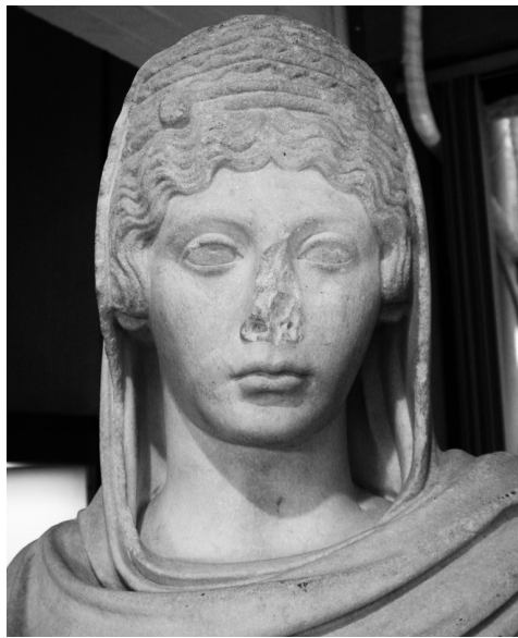
Fig. 11-13. Portrait of a woman in the guise of Aspasia/ Europa, apparently Thasian marble, late Hadrianic or early Antonine, ca. 130-150 CE. Rethymno Museum, Λ150