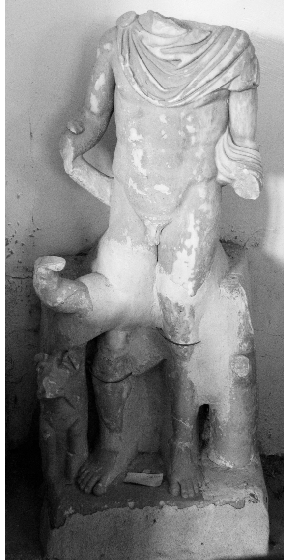
Fig. 13. Statue of Perseus, possibly Pentelic marble, Lambaesis Museum. USF9447

has provisions for inlaying, in this case only the irises. 19