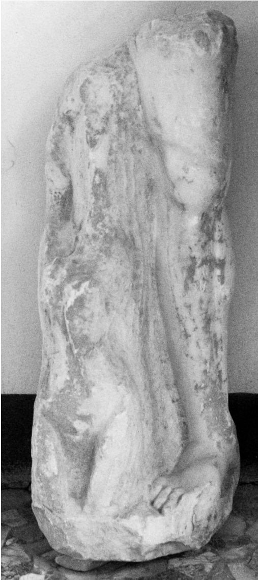
Fig. 12. Fragment of a statue of Perseus, Pentelic marble, Thamugadi Museum. USF10868