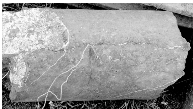
Fig. 17. Small column shaft of fossiliferous limestone, possibly from Boudjoudoune, column deposit, Thamugadi. USF10881

Filfila by its swirling cloudy markings as well as its isotopic signature, USF10880 (Fig. 15). Other important stones of NE Algeria, such as onyx marble from Mahouna and spotted and streaked marble from Cap de Garde, seem to appear rarely at Thamugadi and Lambaesis. They may have been used combined with cipollino in a pavement in