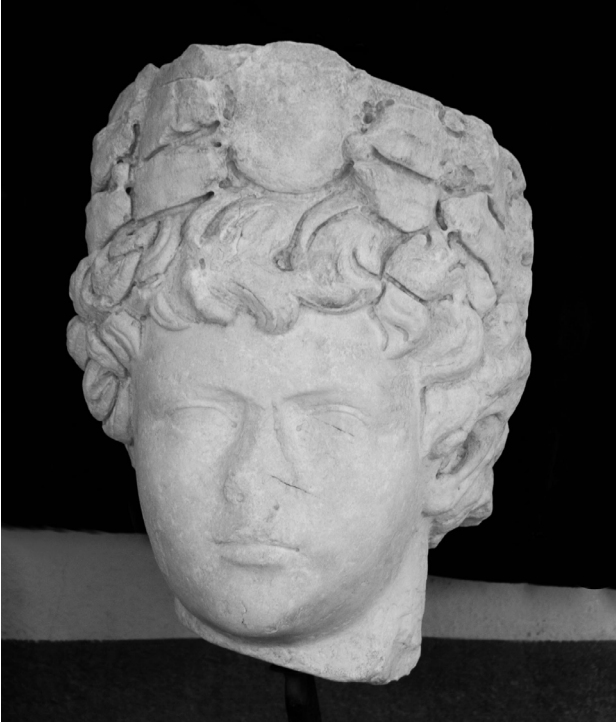
Fig. 8. Portrait of the young Lucius Verus, Thasian marble, Thamugadi Museum. USF26388-9