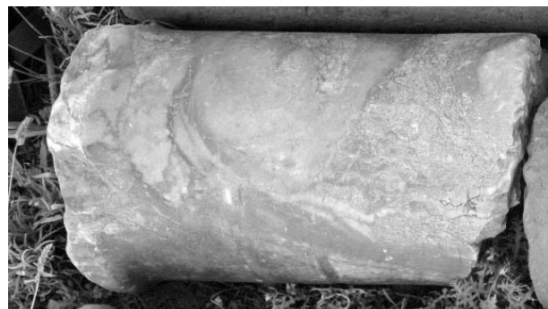
Fig. 15. Small column shaft with swirling gray markings, Filfila marble, column deposit, Thamugadi. USF10880

Pentelic marble was certainly used for at least one of the statues in Thamugadi. A leg from a statue, USF10868, can only come from Mt. Pentelicon, on the basis of its isotopic ratios and the macroscopic qualities of its marble