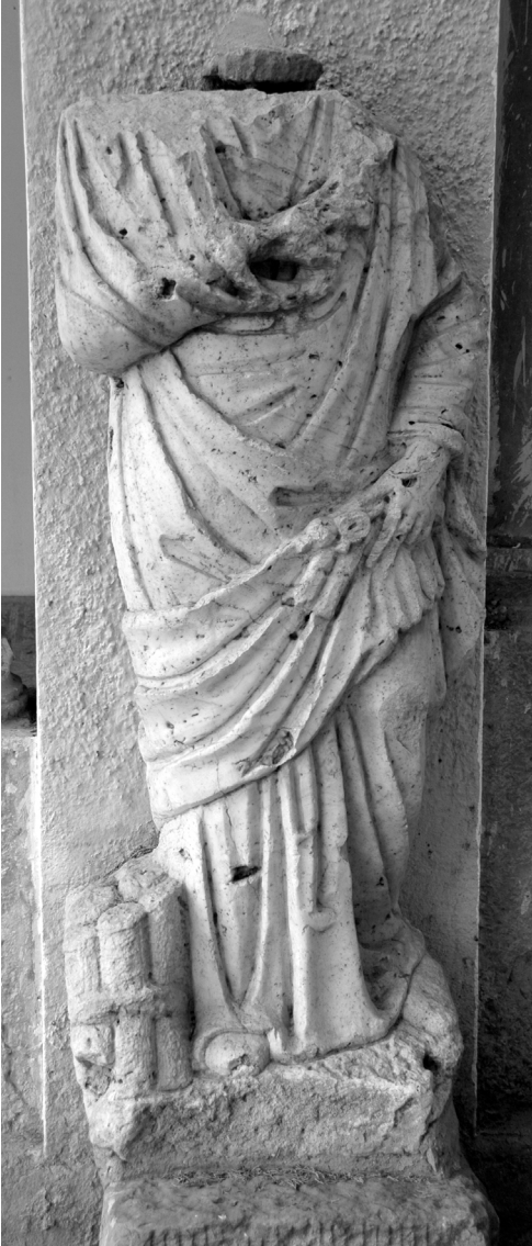
Fig. 14. Statue of woman as Ceres, unknown travertine, Thamugadi Museum. USF10869

Like the portrait busts from Lambaesis in the Louvre, the statues and statuettes of Thasian dolomitic marble in Thamugadi and Lambaesis display no typologies or stylistic characteristics that link them directly to Thasos or northern Greece. If their sculptors originally came from Thasos, they must have been retrained in cosmopolitan workshops in major centers, such as Athens, Rome, or Carthage. Even in Cherchel, with its multitude of marble statues, it is thought that the sculpture was produced by traveling or, at any rate, moveable workshops. 22