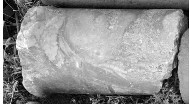
Fig. 15. Small column shaft with swirling gray markings, Filfila marble, column deposit, Thamugadi. USF10880

Pentelic marble was certainly used for at least one of the statues in Thamugadi. A leg from a statue, USF10868, can only come from Mt. Pentelicon, on the basis of its isotopic ratios and the macroscopic qualities of its marble