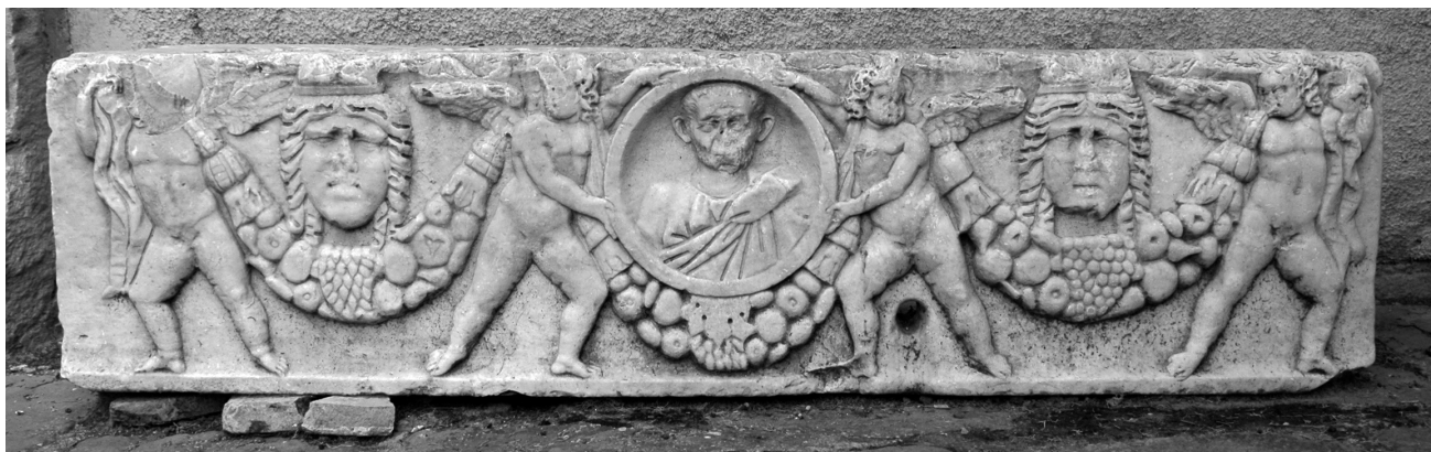
Fig. 2. Garland sarcophagus, third century, marble from Mt. Filfila. Thamugadi Museum. USF9443

Mineralogy was determined by X-ray fluorescence (XRF). These parameters were compared with the results of our survey of Algerian quarries 2 , with a British team's samples from Mt. Filfila, Algeria 3 , with an Italian team's databases for Algeria, 4 and with various databases for other Mediterranean quarries 5 . Algeria's most important modern source of white and gray marble on Mt. Filfila, however, is highly variable analytically. Its stone can have either coarse or fine grain, 6 and its widespread isotopic field shadows that of Afyon/Docimium quite closely. 7 Electron paramagnetic resonance spectroscopy (EPR) has also produced highly variable data for Filfila. 8 While Filfila marble is usually calcitic, 7% of the samples proved to be pure dolomite. 9 As a result of overlappings with analytic data for foreign marbles, macroscopic criteria were often important in establishing probable quarries of origin. Filfila marble, for example, can at times have pale gray areas with a rather distinctive cloudy or smoky effect, although other kinds of markings also appear.