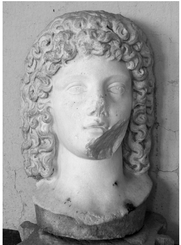
Fig. 11. Head of a young divinity or personification, Thasian marble, Thamugadi Museum. USF23900