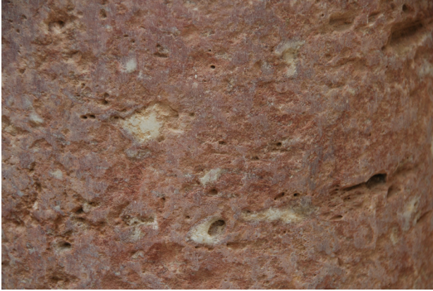
Fig. 21. Column shaft, travertine, Keddel?, 2 nd -3 rd century. Thamugadi Museum. USF10865

limestone, which recalls breccia corallina, comes from an unknown local source (USF10877).