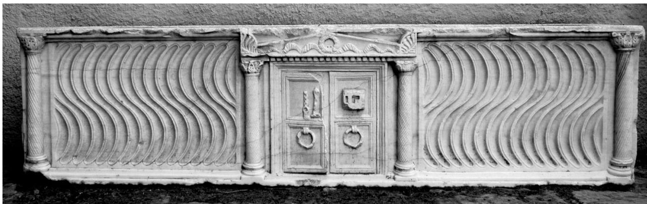
Fig. 4. Strigillated sarcophagus with portrait, probably Proconnesian marble, Thamugadi Museum. USF9444