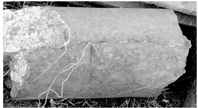
Fig. 17. Small column shaft of fossiliferous limestone, possibly from Boudjoudoune, column deposit, Thamugadi. USF10881

Filfila by its swirling cloudy markings as well as its isotopic signature, USF10880 (Fig. 15). Other important stones of NE Algeria, such as onyx marble from Mahouna and spotted and streaked marble from Cap de Garde, seem to appear rarely at Thamugadi and Lambaesis. They may have been used combined with cipollino in a pavement in