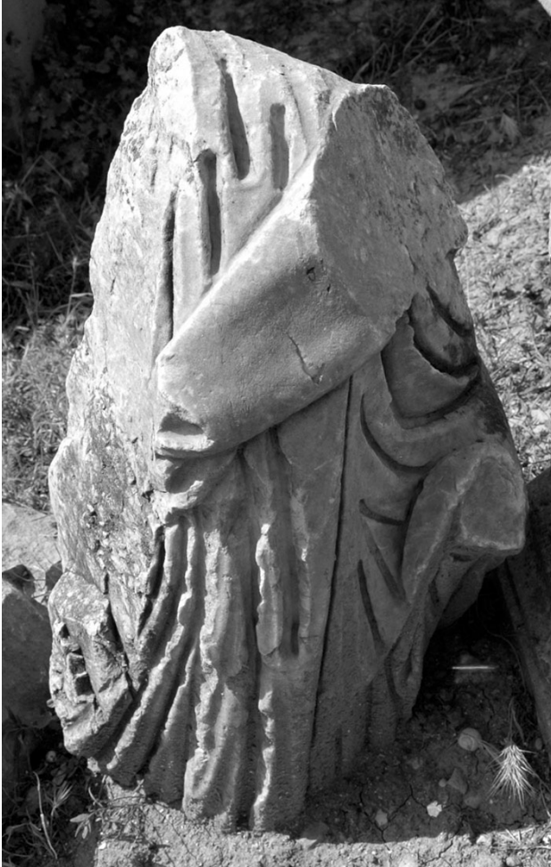
Fig. 6. Fragmentary togatus, Filfila marble, Lambaesis Museum. USF10884