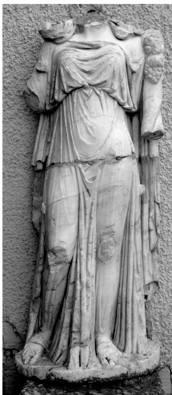
Fig. 5. Statue of Concordia, probably marble from Mt. Filfila, Thamugadi Museum. USF9441

Isotopically, a good quality strigillated sarcophagus, USF9444, 12 could be of either Filfila or Proconnesian marble (Fig. 4). Macroscopically it has a few long gray bands that are more typical of Proconnesian and several irregular cracks that seem more typical of Filfila. The design with columns at the corners and a central doorway enclosed in an aedicula is a standard type known from