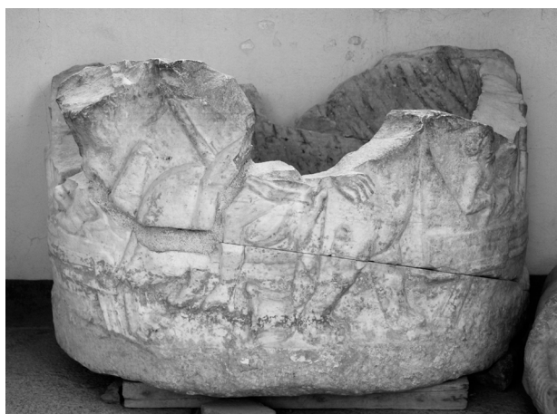
Fig. 3. Basin with Bacchic reliefs, marble from Mt. Filfila, Thamugadi Museum. USF10867

Some of Algeria's many quarries of colorful marble and travertine have also been analyzed isotopically, 10 but comparable data for colored marble quarries on the north shores of the Mediterranean are scanty. As a result, macroscopic identifications are important in this realm as well.