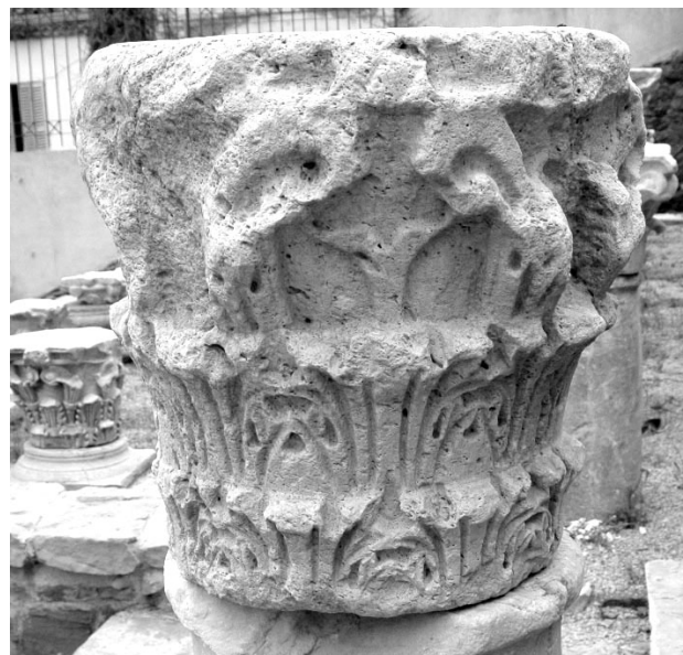
Fig. 19. Corinthian capital, third century, probably Filfila marble. Rusicade (Skikda), Theatre

decoration accumulated in the theatre. 38 The sculptor probably carved USF10863 at Thamugadi since one of its volutes is left unfinished. 39