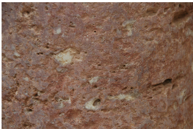
Fig. 21. Column shaft, travertine, Keddel?, 2 nd -3 rd century. Thamugadi Museum. USF10865

limestone, which recalls breccia corallina, comes from an unknown local source (USF10877).