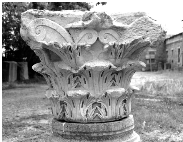
Fig. 18. Corinthian capital, ca. 300, Filfila marble. Thamugadi Museum. USF10863