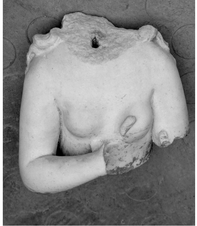
Fig. 10. Statuette of Venus of the Capitoline type, Thasian marble, Lambaesis Museum 47. USF9446