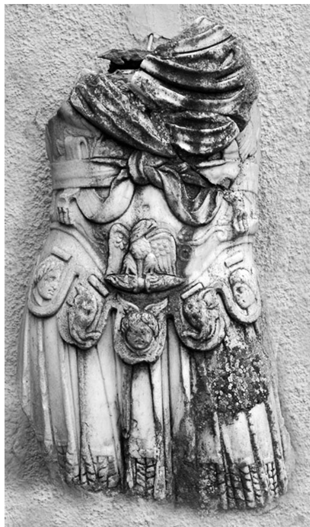
Fig. 20. Cuirassed torso of Lucius Verus from the Curia, Thamugadi, Thasian marble. USF9440

Laboratory analyses have indicated some novel sources for colored stones. Travertine may have come from Mt. Keddel on the Tunisian coast (USF10865) (Fig. 21). A piece of rose-colored marble from Thamugadi seems to come from Aïn Tekbalet, western Algeria (USF10876). An attractive red and green breccia