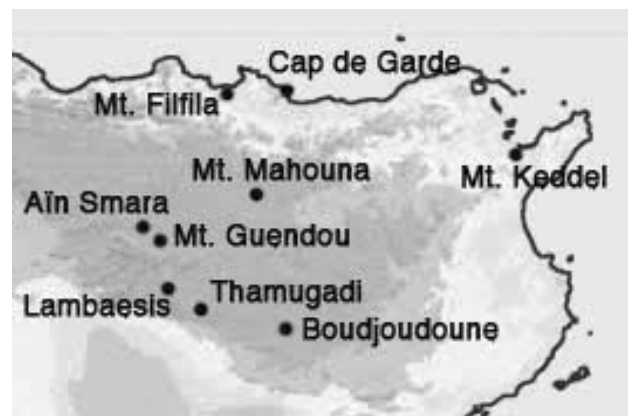
Fig. 1. Map

Starting in 81 CE, the Roman emperors founded military camps and then cities at Thamugadi (Timgad) and Lambaesis (Tazoult/Lambèse) only 24 km from one another in southern Numidia as bases to control the Berber population of the Aurès Mountains in eastern Algeria (Fig. 1). The Mediterranean coast lies ca. 200 km to the north, and the nearest well-known source of high quality decorative stone is the alabaster of Aïn Smara, 122 km to the north. Thamugadi and Lambaesis were largely built of limestone and sandstone of apparently local origin 1 , but they also have a significant presence of marble