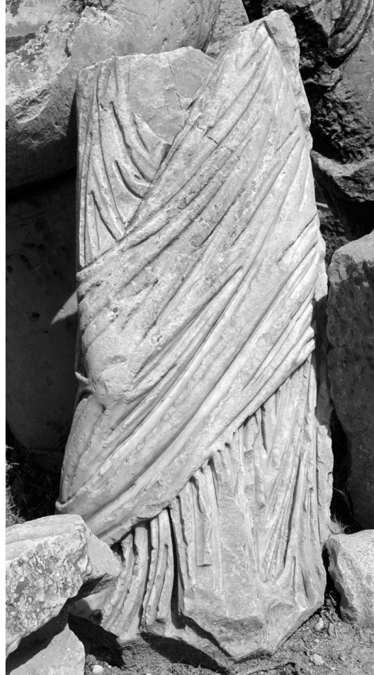
Fig. 7. Lower half of draped woman, Filfila Marble, Lambaesis Museum. USF10885