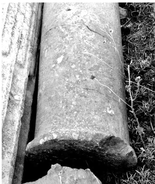
Fig. 16. Small column shaft of fossiliferous limestone, possibly from Guendou, column deposit, Thamugadi. USF10878

Filfila by its swirling cloudy markings as well as its isotopic signature, USF10880 (Fig. 15). Other important stones of NE Algeria, such as onyx marble from Mahouna and spotted and streaked marble from Cap de Garde, seem to appear rarely at Thamugadi and Lambaesis. They may have been used combined with cipollino in a pavement in