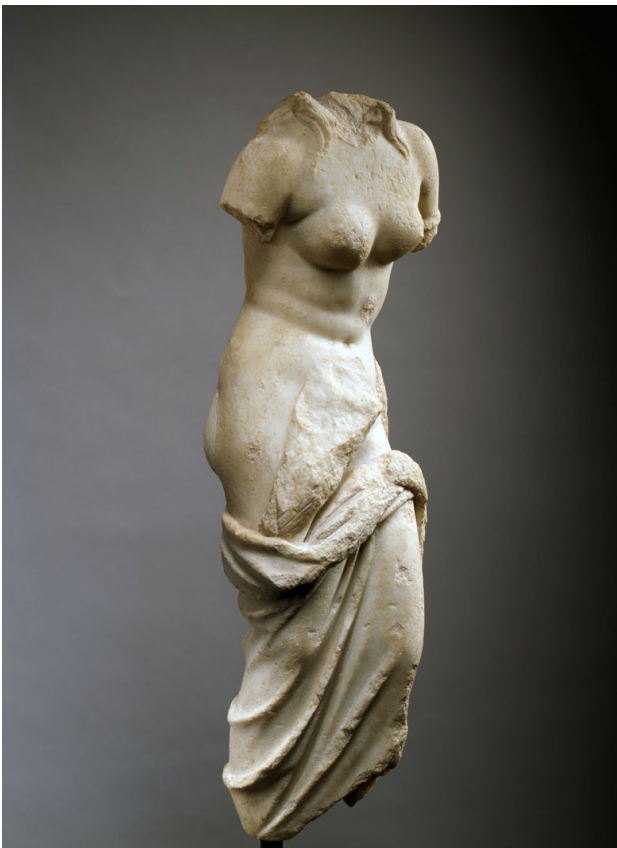
Fig. 3. Statue of Leda and the Swan