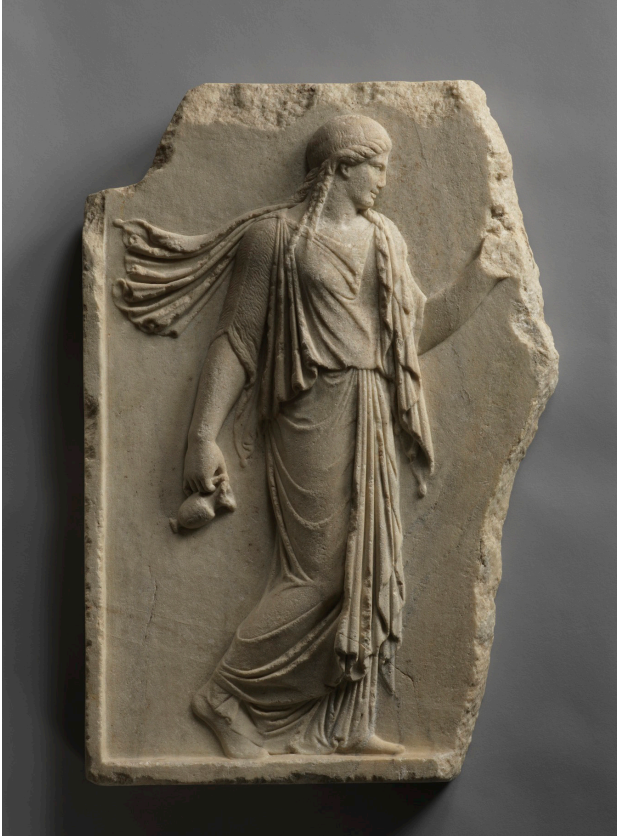
Fig. 2. Relief of a draped woman