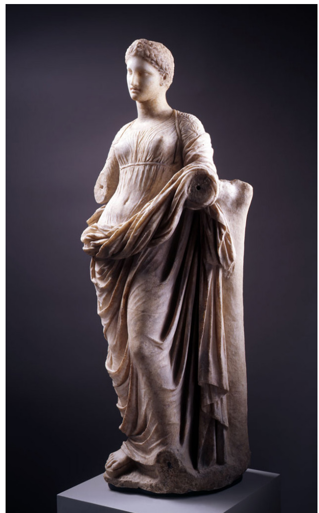
Fig. 1. Statue of a draped woman (Aphrodite?)

Following visual assessment of marble color, patterning, translucency, and maximum grain size (MGS), powder samples were drilled from each sculpture. In cases of sculptures assembled from different elements,