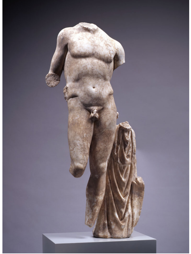
Fig. 4. Statue of Apollo of Anzio type