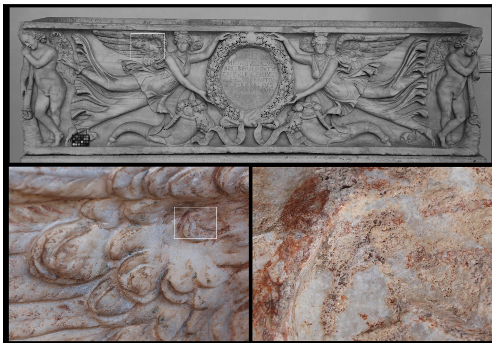
Fig. 3. The details of Victoria right wing show the original and secondary paintings that have affected the Ulpia Domnina 's sarcophagus. Here, we can also see that her flight feather is painted red, whilst the short feathers are blue like a well-known conventional 'pictorial paradigm' (MNR-TD inv. 125891)

copper, which was intentionally used as a ground layer for the gold leaf to give a different emphasis to the overlying gold (SAPELLI 2002, 194). In this respect, it is interesting that Reiner Sörries and Ulrike Lange did not consider grey-green and grey-blue as real colours but as a degraded state of silver (LANGE, SÖRRIES 1986, 14).