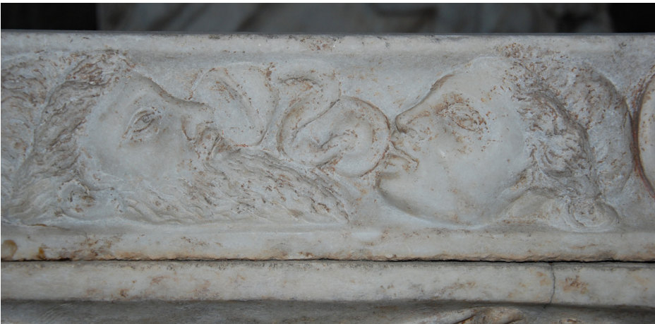
Fig. 7. Black colour was superimposed on red to highlight chiaroscuro contrast on the masks hair, shave and features face on the lid's Dionysian sarcophagus (MNR-TD inv. 124736)

used to create effects of light and shade, which in turn highlight their brilliance and contrast as well as the sense of relief depth. This is the case, for example, of a strigilated lenòs sarcophagus with portrait and groups of lion and victim (fawn) at the corners, and a large rectangular lid terminating in semi-circular antefixes (Museo Nazionale Romano – Terme di Diocleziano, inv. 124745) where red and yellow ochre have been used to create the palmettes with only the use of colour on the lid antefixes and the male lions' manes. The same use of colours to generate chiaroscuro effects is also visible in some Dionysian sarcophagi dated at the end of the 2 nd century as, for example, the so-called 'Conservatori sarcophagus' in the Musei Capitolini, inv. 1378 (PIETROGRANDE 1932). Here, the combination of red and yellow ochres is well-preserved on the lion's mane and the horse's mane and tail (Fig. 6; SIOTTO 2017, 163).