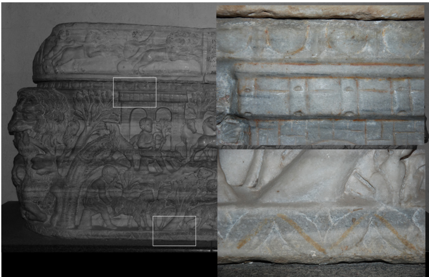
Fig. 5. Polychrome details show red colour superimposed on yellow layer to highlight the Ionic and Lesbian kymàtia , and the wood roof elements of the shepherd's hut on the bucolic sarcophagus dedicated to Iulius Achilleus (MNR-TD inv. 125802)

diluted yellow ochre have been used as a substrate for very thin lines of dense red ochre, which highlight minute details such as eyelashes and eyebrows (Fig. 4). These thin lines of dense red ochre on lines of diluted yellow ochre have also been used to paint bracelets ( armillae ) or some leather details such as saddlebags and shoelaces or, again, wooden elements (Fig. 4) such as tree bark, chariot spokes, sticks, hoes and spades (SIOTTO 2017, 159).