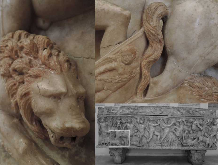
Fig. 6. Red and yellow have been used to create chiaroscuro effects on the lion mane and horse tail in the so-called 'Conservatori sarcophagus' (MC inv. 1378)