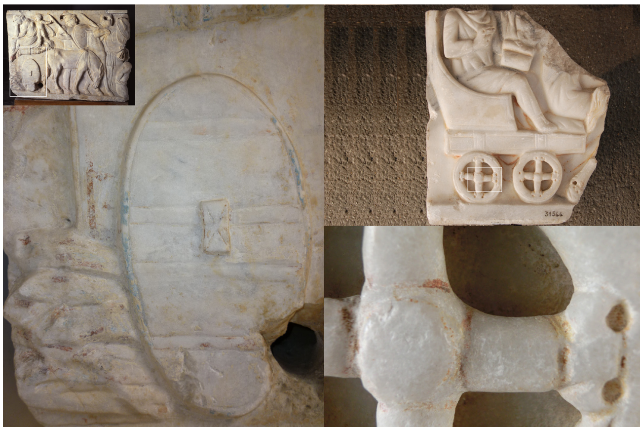
Fig. 10. The metallic elements are usually painted blue, while the wood objects are red (and yellow) on Roman marble sarcophagi from the early 2 nd century to the late 4 th century AD; this correspond with a 'pictorial paradigm'

example, on the sarcophagus with Victories holding a clypeus and seasonal Genii with Oceanus and Tellus in the Necropolis of Santa Rosa in the Vaticano, inv. 52198 (SIOTTO 2017, 102-103), on the front of sarcophagus of Olympus Antistianus in the San Panfilo Catacomb (AMBROGI 2008) and on the 'Annona sarcophagus' (SIOTTO et al. 2015).