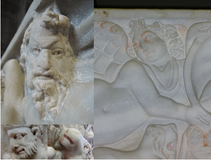
Fig. 8. The polychrome details show that bright pink is ordinarily used to paint the inner parts of mouth, nostrils, lachrymal ducts (and blood that comes out of the wounds) on Roman marble sarcophagi from the early 2 nd century to the late 4 th century AD; this correspond with a documented 'pictorial paradigm'