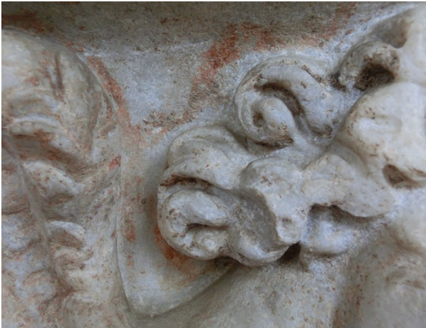
Fig. 11. Red colour is commonly used to outline, along the background, the body shapes of relief as shown on the Ulpia Domnina's sarcophagus (MNR-TD inv. 125891); this correspond with a known 'pictorial paradigm'