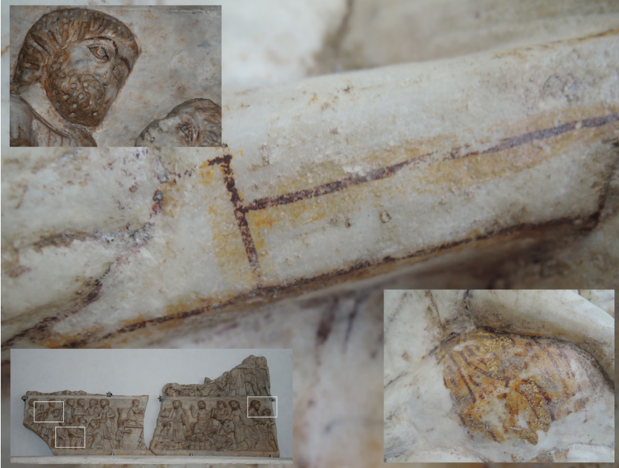
Fig. 4. The details show thin red lines overlapped to diluted and large yellow lines to highlight and draw some elements through the colour on the 'polychrome slab' (MNR-PM inv. 67606, 67607)