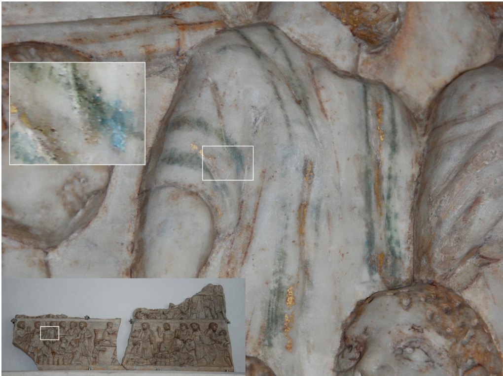
Fig. 2. A Christ's tunic detail on the so-called 'polychrome slab'; here apparently green colour paints the parallel vertical and horizontal bands. The macro-digital image proves that green colour was originally blue (MNR-PM invv. 67606, 67607)

the 4 th century AD. The range of colours used is quite wide and the pigments identified (Fig. 1) were representative of the ancient painting context of the Mediterranean area (BRINKMANN 2004). In particular, it was possible to recognize natural inorganic pigments, such as yellow and red ochres, haematite and mercury sulphide (cinnabar); artificial inorganic pigments, such as Egyptian blue, red lead and white lime; organic pigments, such as carbon black and bone black, and, in the end, organic dyes such as red vegetal lake (SIOTTO 2017, 33-45).