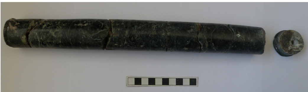
Fig. 11. Small column of africano marble; a twin is stored at the Archaeological Museum of Istria in Pula