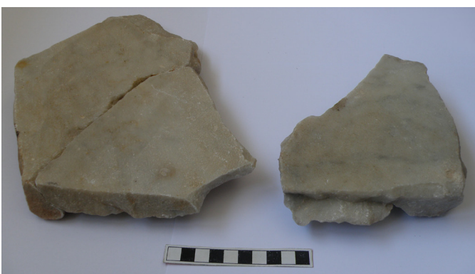
Fig. 12. Two parts of a thick hexagonal floor slab