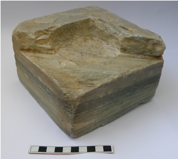
Fig. 9. Cube made of cipollino verde