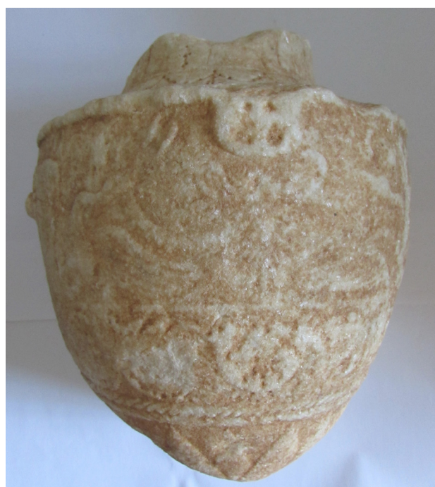
Fig. 6. Hydria, part of a sculpture, in white marble, from the temple area

The most significant fragments of marble sculptures that Gnirs found (Fig. 5) were located in the area of the temples in Verige Bay. These were small fragments, such as the thumb of a female hand, folds of clothes and curls of hair (Fig. 5). However the most important object discovered was part of a hydria (Fig. 6), a vessel with three handles for the transportation of water. It was found in 1907. 19 It was richly decorated with palmettes and antithetically placed flying swans made of white fine-grained marble. These finds helped him to recognize a Roman copy of the famous Praxiteles statue of Aphrodite from the island of Cnidus. 20