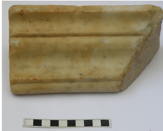
Fig. 10. Molded block and plinth in fine grained white marble