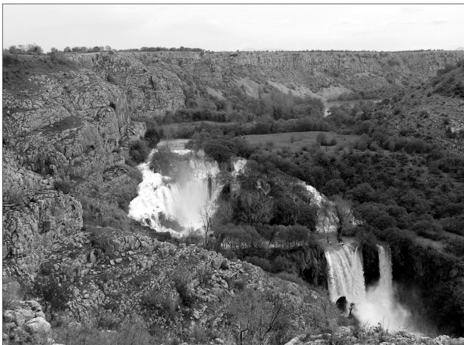
Fig. 5. The large tufa dams of the Manojlovac waterfall within the Krka River canyon

that time, the construction of side entrance walls, covered passages, auditorium and arena walls took place. As a result of the extensive construction works, the Burnum amphitheatre took on monumental proportions. The works were conducted by the soldiers of Legio IIII Flavia felix , stationed in Burnum during that period.