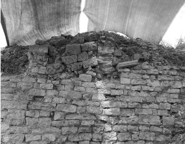
Fig. 3. Use of local tufa and marly limestone as a construction materials in the amphitheatre

widened cracks between grikes in the lower section of doline slopes were modified so as to function as drainage channels. Although the auditorium was in very poorly preserved state, the construction method the the seating rows was documented. It is hypothesised that the capacity of the Burnum amphitheatre was suitable for six or more thousand spectators.