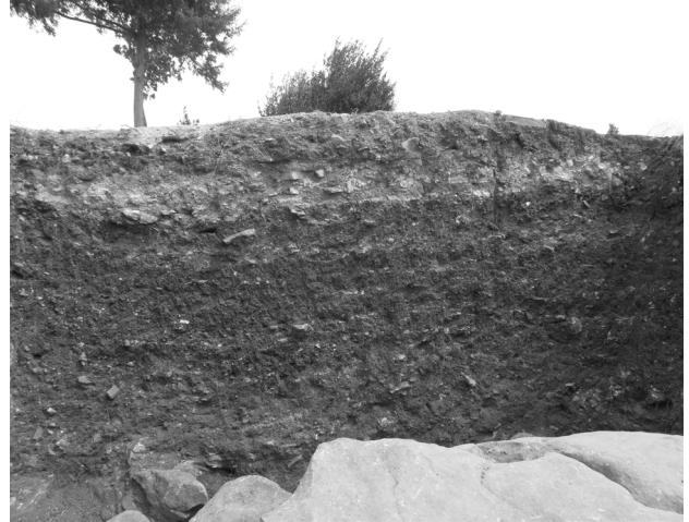
Fig. 4. Infill of grikes for the purpose of levelling the surface prior to construction works

northwestern periphery where the Legio XI CPF soldiers built an amphitheatre and other military buildings. 4