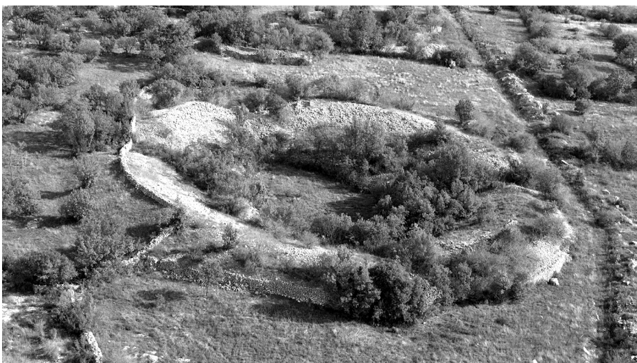
Fig. 2. Aerial photograph of Burnum amphitheatre prior to archaeological works

Archaeology of the University of Zadar and the Municipal Museum of Drniš in cooperation with Laboratorio di Rilievo delle Strutture Archeologiche del Dipartimento di Archeologia dell'Università di Bologna supported by Krka National Park (e.g. CAMBI et al. 2006; CAMBI et al. 2007; CAMBI et al. 2008, 397-408; GLAVIČIĆ, MILETIĆ 2009, 75-84; GLAVIČIĆ 2011, 289-313; GLAVIČIĆ, MILETIĆ 2013, 157-172). The research revealed the construction of an amphitheatre ( amphitheatrum ) and some other military structures on the northwest margin of the Roman military camp (Fig. 1). It was also determined that the karst area was levelled, small depressions being filled by material consisting of small scale archaeological remains such as military equipment, arms fragments and everyday items. About the whole expanse of the amphitheatre was explored in detail. Constructional solutions that were adopted for the integration of objects within the natural