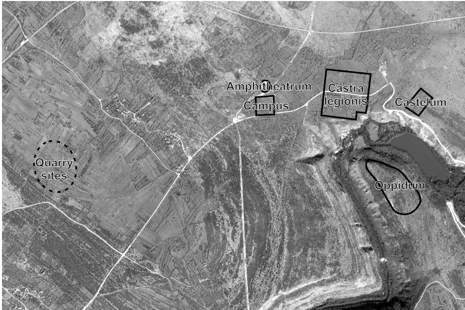
Fig. 6. Location where there were quarries of bedded marly limestone in antiquity

The surrounding plain in the wider area of the Burnum amphitheatre is built of Paleogene age carbonates. North of the site is an axis of an anticline in the northwest-southeast direction. A limited area around the amphitheatre consists of Eocene and Oligocene carbonate conglomerate with thin beds of limestone. It is surrounded by Eocene and Oligocene bedrock, which comprise limestone conglomerate, breccia and layers of marl (GRIMANI et al. , 1966, 36). Throughout our survey relatively thick layers of marly limestone were identified only in a few isolated strata.