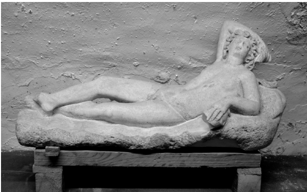
Fig. 13. Sleeping Satyr, fountain figure, dolomitic marble from Thasos, ca.120-150, Musei Vaticani MV 7254

Switzerland 16 may have better chances of belonging to the Vatican group. A four-sided stepped pyramidal fountain is placed in the center of a courtyard adjoining the Octagon of St. Paul in Philippi. 17 The fountain could well have been imported from the West but has no apparent relationship to the Vatican group.