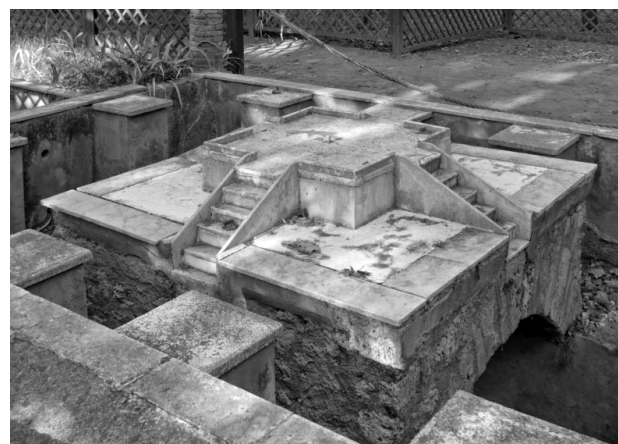
Fig. 1. Pompeii, House of Octavius Quartio, Fountain in the Euripus, 62-79 CE.

Four possible Thasian marble fountains in the Magazzino ex-dei Ponteggi of the Vatican Museums were identified by eye on the basis of their coarse grain, absence of gray marks, and glittering grains. For verification, chip samples were taken and analyzed at the Istituto di Struttura della Materia, Consiglio Nazionale delle Ricerche, Roma, making use of magnetic resonance spectrography (EPR) to determine if they were dolomite or calcite. As is now widely accepted, the Cape Vathy/Saliari Area on Thasos was the only source of pure white, coarse-grain dolomitic marble for sculptural purposes during antiquity. All four