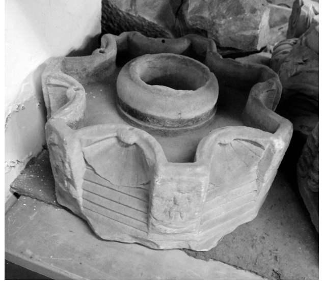
Fig. 11. Fountain with wanderings of Ulysses, fine-grained (Carrara?) marble, ca. 100-150, Musei Vaticani