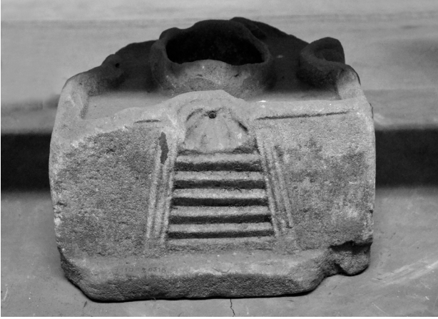
Fig. 5. Fountain with tapering stairs, dolomitic marble from Thasos, late first or second century, Musei Vaticani, MV 1110