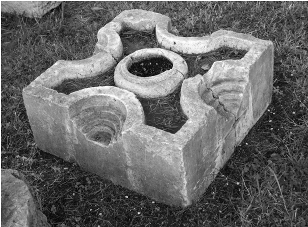
Fig. 3. Fountain, marble, 2 nd century, Pula

upper platform. It then spilled down stairs on all four sides into a surrounding pool. The fountain is built of masonry and jacketed with marble. The House of Apollo (VI.7.23) formerly had a small eight-sided pyramid with steps on four sides, again built of masonry jacketed with marble and located in the center of a pool. 3