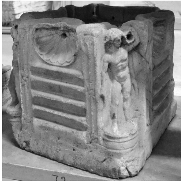
Fig. 8. Fountain with waterboys in the corners, dolomitic marble from Thasos, ca. 125-150, Musei Vaticani, MV 649

hand, the absence of drillwork suggests that the fountain is not likely to be much later than Hadrianic either.