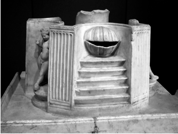
Fig. 12. Fountain with Cupids, fine-grained marble, late first or early second century, Tarragona, Archaeological Museum