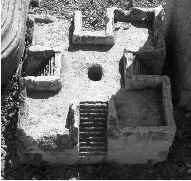
Fig. 2. Fountain, unknown coarse-grained marble, 2 nd century, Lambaesis, Museum