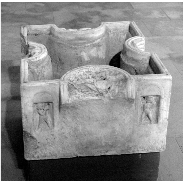
Fig. 7 a-c. Fountain with a sleeping nymph, sleeping satyr, and water boys; probably Thasian marble, late first or second century, Pula, Temple of Roma and Augustus