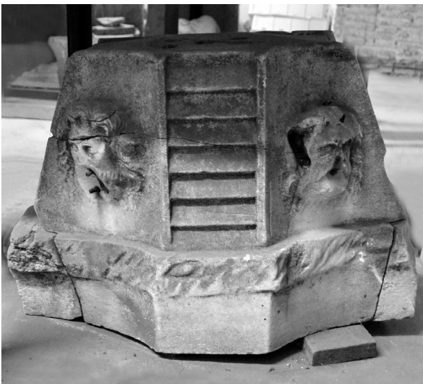
Fig. 10. Fountain with heads of river gods, dolomitic marble from Thasos, ca. 90-140, Musei Vaticani, MV 1134