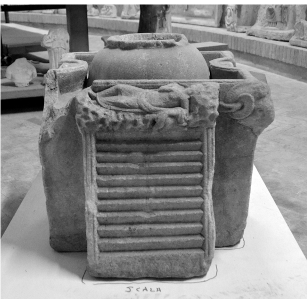
Fig. 6a, 6b. Fountain with Medusa heads and a sleeping nymph, dolomitic marble from Thasos, late first or second century, Musei Vaticani, MV 7523

(Fig. 5), 7 which returns to the basic cubic shape (the sides of the block are vertical). The sides of the stairs, however, slope to give the illusion of that they project.