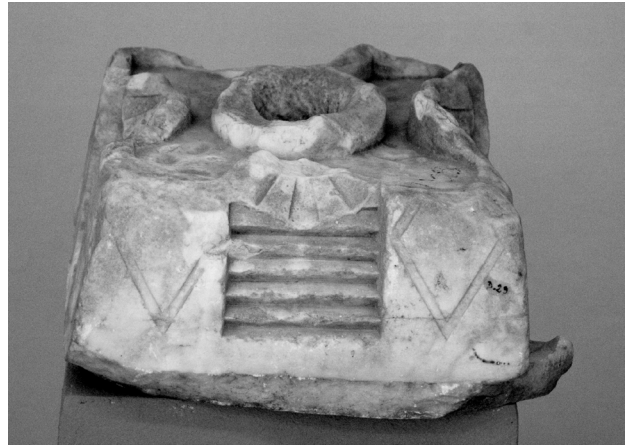
Fig. 4. Fountain with incised diamonds, fine-grained marble, 2 nd century, Cherchel, New Museum

could take the form of a four-sided stepped pyramid, as in the 3 rd century Domus dei Pesci at Ostia. 4 In other cases, the spout could take a cubic form, like that of the House of Octavius Quartio. In a very simple example in Lambaesis, Algeria (Fig. 2), the stairs have been retracted into the block, perhaps for ease of carving and efficient use of the marble block. Lambaesis lies on the southern frontier of ancient Numidia and was founded by Hadrian between 123 and 129. Another example in Pula, Istria (northern Croatia) presents the same cubic outer contours, but the staircases have become semicircular, and the waterspout at the top center has taken the form of the shoulder and rim of a jar (an olla or perhaps a crater ) (Fig. 3). 5 In another Algerian example in Cherchel, ancient Caesarea Mauretaniae, the two types seem to be mixed (Fig. 4) 6 ; the block is a low truncated pyramid, but, like the cubic type, it has a pool on top.