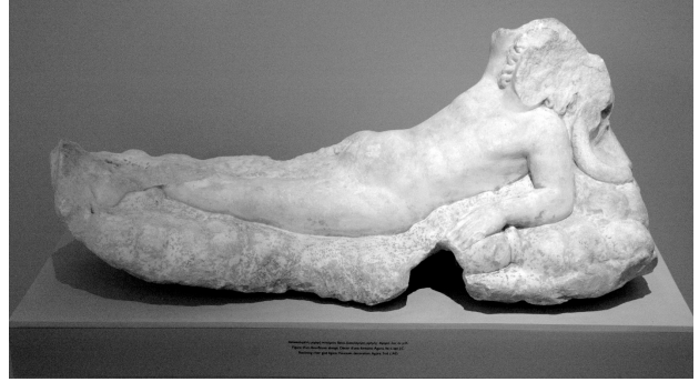
Fig. 14. Sleeping Satyr, fountain figure, probably Thasian marble, ca.120-140. From the Agora, Thasos, Thasos, Museum

The picture that emerges from this review of monolithic marble fountains of the span of about 70-140 CE is one of a rapidly evolving and diversified decorative tradition. Clients and workshops were competing to outdo one-another in luxurious novelties, but simple and presumably economical models also survived. The workshop using Thasian marble seems to have specialized in the relatively old-fashioned cubic fountain, but they gave this type a series of decorative variations that made no two pieces the same.