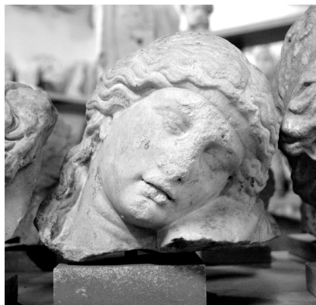
Fig. 16. Head of Ariadne sleeping, probably Thasian marble, 100-150, Musei Vaticani, MV 4339