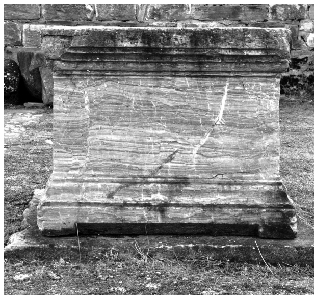
Fig. 8. Iasos (Turkey), Agora, southern portico, pedestal no. 11