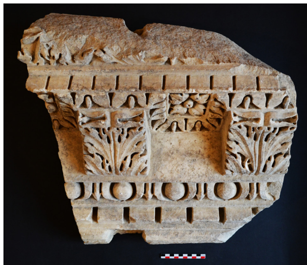
Fig. 3. Vaison-la-Romaine, Forum, cornice, white Carrara marble