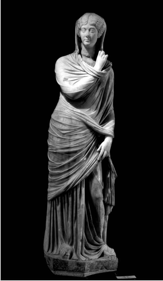
Fig. 6. Istanbul, Archaeological Museums – Draped female portrait-statue of the Ceres type, from Pisidian Antioch, sanctuary of Men