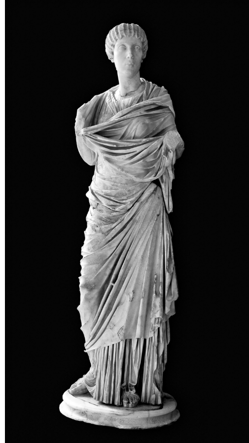
Fig. 7. Lepcis Magna, Museum – Draped female portrait-statue of the Orans type (cat. no. 37), Göktepe marble, from the Serapeum

we should bear in mind that in the 2 nd century AD many flourishing and accomplished local sculpture workshops were active in Lepcis (Fig. 3). These workshops could have met the demand of the local market and work with imported marbles, adapting to the stylistic trends in vogue at that time.