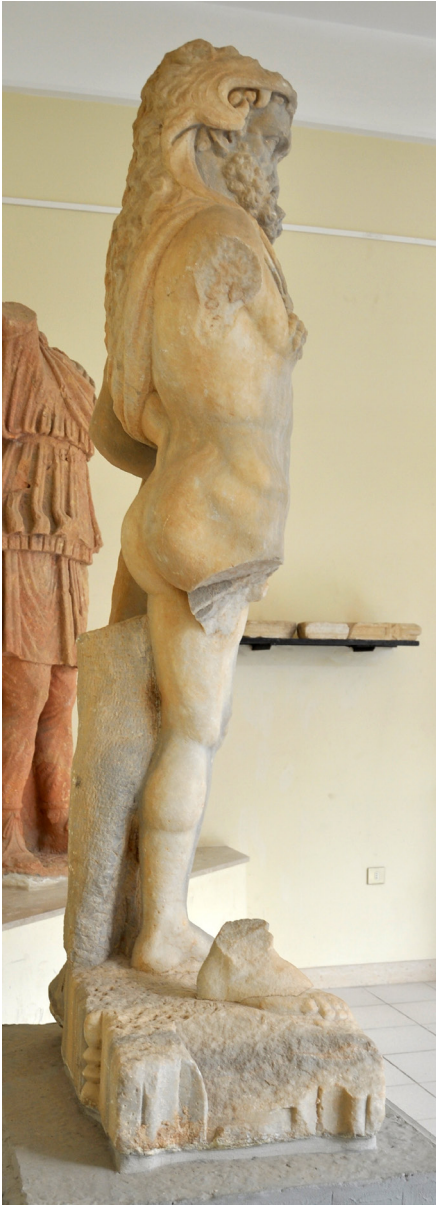
Fig. 8. Lepcis Magna, Museum – Statue of Hercules, with the remains of the reused architrave, Proconnesian marble, from the so-called Nymphaeum of Hercules

clearly show along their lower edge and on their back the remains of the decoration of the original architrave. 21