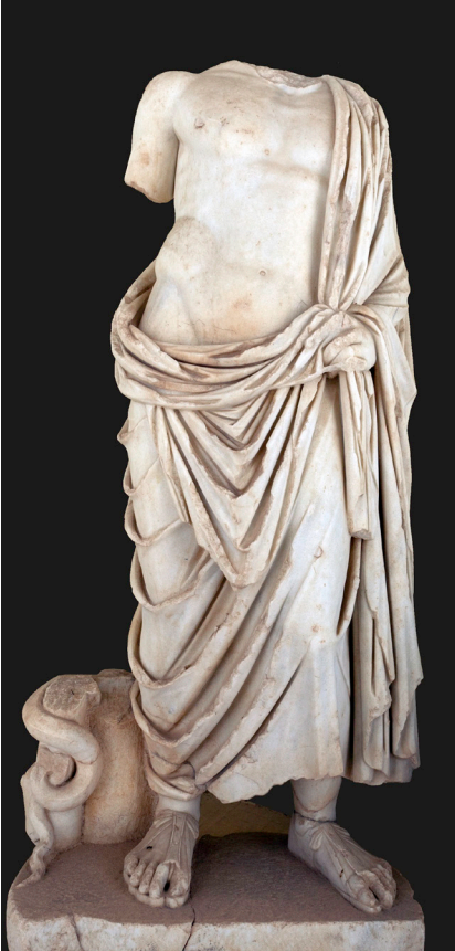
Fig. 4. Lepcis Magna, Museum – Headless statue of Aesculapius (cat. no. 34), Proconnesian marble, from the Hadrianic Baths