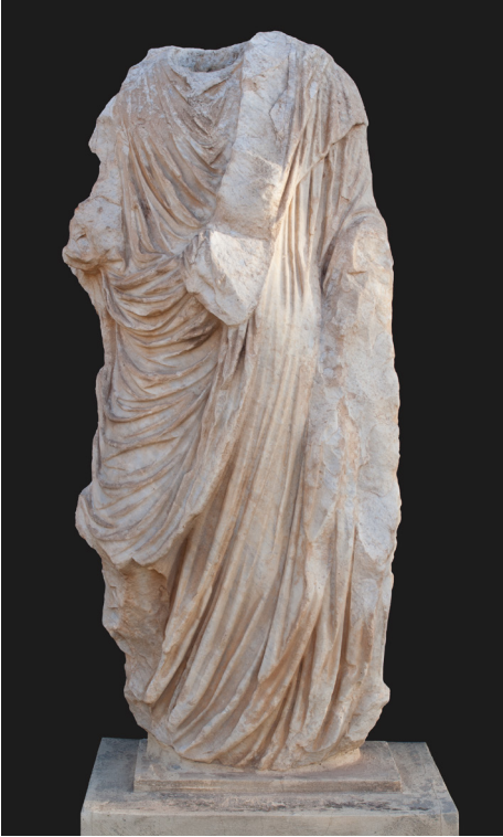
Fig. 2. Lepcis Magna, Old Museum – Headless togate statue (cat. no. 24), Luna marble, from the Theatre (Archaeological Mission of the University Roma Tre, Fabian Baroni)