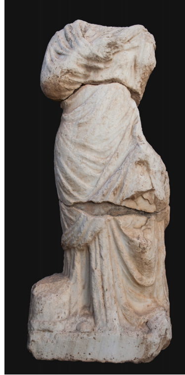
Fig. 3. Lepcis Magna, Old Museum – Headless draped female portrait-statue of the Ceres type (cat. no. 1), Pentelic marble, from the Mausoleum of Gasr Duirat

coarse grained white marble from Italy (Carrara/Luna), Greece (Pentelic; Paros I and II; Thasos Alikei and Vathy) and Asia Minor (Göktepe; Aphrodisias; Docimium; Ephesos; Proconnesos).