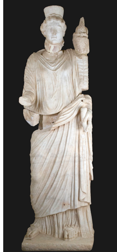
Fig. 5. Lepcis Magna, Museum – Statue of Tyche (cat. no. 38), Göktepe marble, from the Serapeum

represented by a peplophoros statue (cat. no. 21). In this period the use of Proconnesian marble gains prominence, a phenomenon amplified and made possible by the massive Severan building project, whose construction demanded the import from the quarries on Marmara Island of huge quantities of such material, as testified by the fragmentary relief with female captive from the Severan Arch (cat. no. 3). Finally, an additional togate statue made of Luna marble (cat. no. 13) may be dated to the late 3 rd century AD.