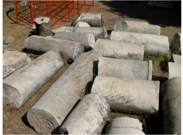
Fig. 8. Column shafts of the 2 nd storey of the scaenae frons

breccia corallina from the Karaburun peninsula 16 , giallo antico and pavonazzetto (Fig. 4).