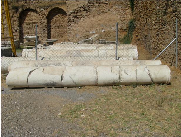
Fig. 7. Column shafts of the 1 st storey of the scaenae frons