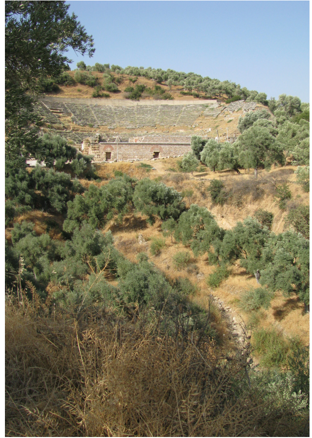
Fig. 2. View of the theatre from the South

As the geological settings indicate, Nysa had marble sources in its proximity. An ancient quarry district was identified ca. 2 km west of the city near the modern village of Eskihisar 7 . Tool traces on the quarry faces and remains of the quarry output – e.g. blocks and large-size column drums – clearly testify to ancient extraction of construction material (Fig. 1). Both macroscopic observations and chemical investigation indicate that the local quarry of Nysa provided two varieties of medium-grained marble of different colour: white and a blue-grey, respectively. Both marble varieties show