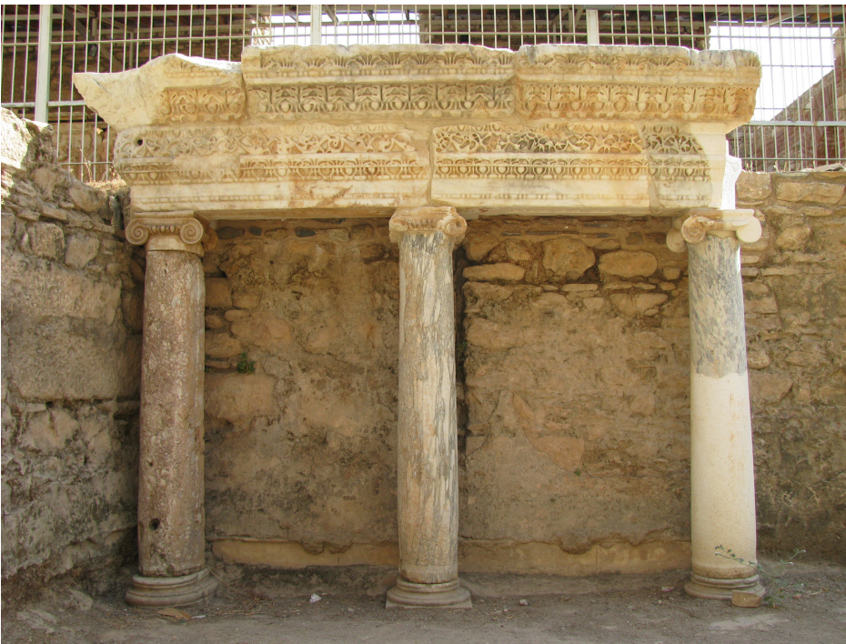
Fig. 4. The restored columnatio of the proskenion

the urban settlement had an orthogonal street system 10 . The theatre was situated at the north of the city and leaned with its cavea against the mountain slope (Fig. 2).