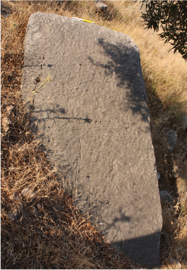
Fig. 1. Local quarry of Nysa. Abandoned block at the quarry

– abounded in marble sources that were consequently used as construction material for the local urban adornment. The high incidence of marble sources was determined by the geology of these regions whose boundaries nearly coincided with the geologic unit of the Menderes-Massif and also included a part of the Attic-Cycladic-formation 6 .