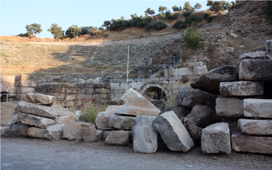
Fig. 3. Blocks from the analemma -walls