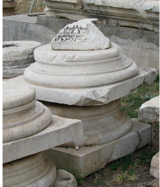
Fig. 6. Reused cornice (see the denticules on the upper torus carved to a basis of the 1 st storey of the scaenae frons )

The marble of the theatre seats is white-grey coloured whereas the material of the analemma -walls includes in addition to this white-grey marble, also a grey-bluish variety (Fig. 3). These petrographic features (colour, grain size, patina) suggest the local origin of the marble; the EPR and isotopic analysis conducted on samples from two analemma -blocks demonstrate that this marble was quarried locally (see below, Table 1 and 2). White-grey and grey-bluish marble blocks of small, irregular form are also used for the opus-mixtum and opus incertum -facing of the proskenion and of the building stage 14 . It can be inferred that the bulk of the marble used for the construction of the theatre was of local origin and that the local quarries were still exploited in the Imperial time.