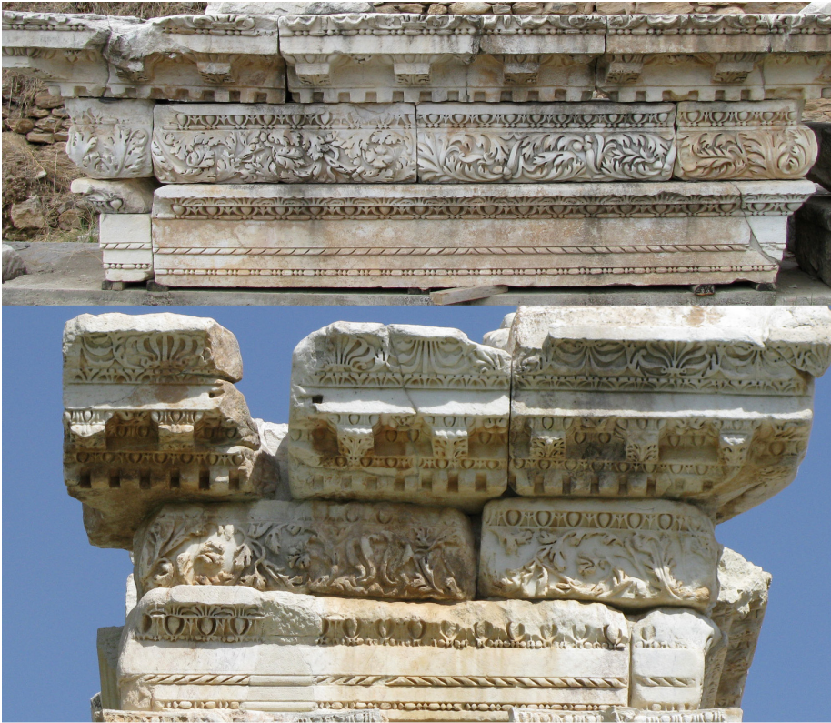
Fig. 9. Comparison of the entablature of the 1 st storey of the scaenae frons of the theatre at Nysa (above) and the one of so-called Tetracyllon at Aphrodisias (below)