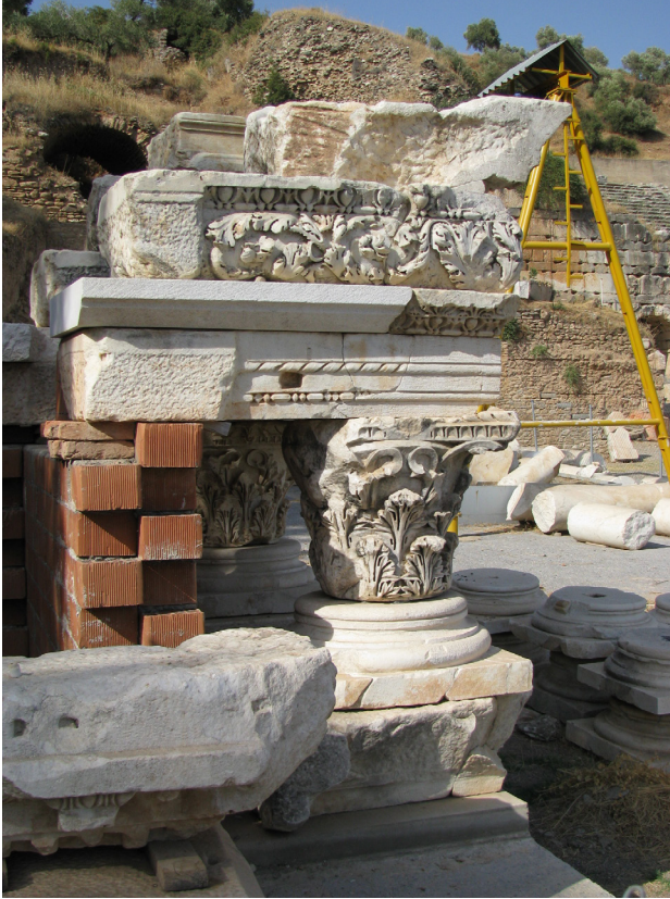
Fig. 5. The column architecture of the 1 st storey (excepting the shaft). The upper profile of the architrave is carved separately

the proskenion , the stage building and scaenae frons were built during the 2 nd century A.D. when they also underwent renewal and restoration. In his study of the theatre, Kadioğlu could distinguish two Imperial time construction phases: one during the Hadrianic period and a second phase dating in late Antonine-early Severan time (180–200 A.D.). The preserved architectural elements allow only the reliable reconstruction of this latter phase; the Hadrianic time construction activity is mainly evidenced by the stylistic features of the architectural decoration of the proskenion and few architectural elements reused in the later phase 13 .