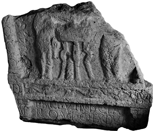
Fig. 3. Funerary stela from Aljmaš, AMZ (Lupa 4308)