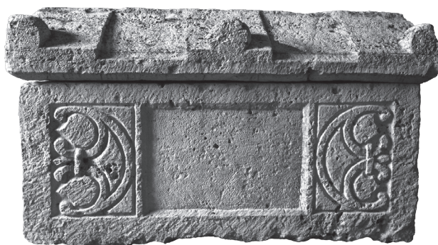
Fig. 1. Child sarcophagus from Sisak, AMZ (Lupa 573)

Croatia (Djurić et al. , in this volume). In view of this fact, the present paper addresses two travertine monuments that have already been characterised (a child's sarcophagus from Siscia / the modern town of Sisak in north-west Croatia, and a stela from the ager of Mursa ), while the core of the discussion rests with the remaining four, not yet analysed, pieces (an ash chest and three stelae, all from Sisak). They will be discussed as cases in point to illustrate and preliminarily verify the importance of the characterisation of monuments made of stone other than marble.