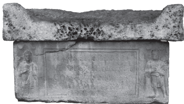
Fig. 5. Ash chest from Sisak, AMZ