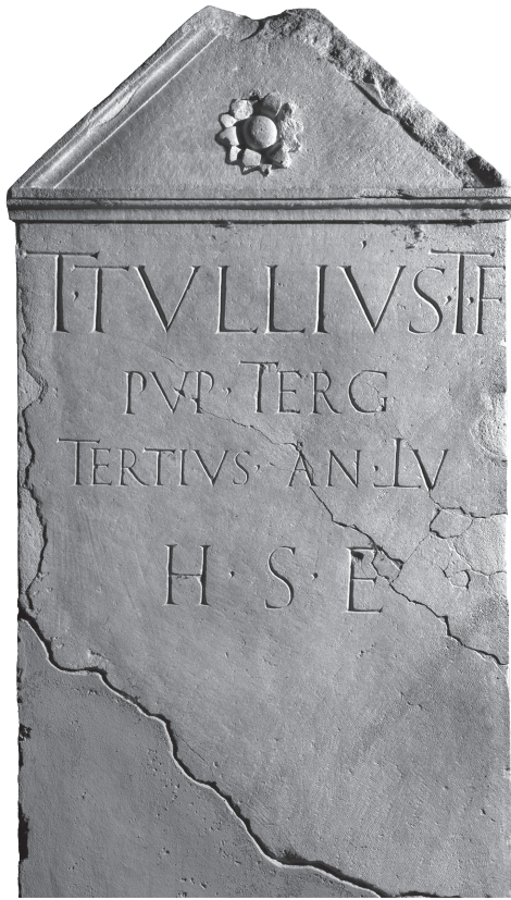
Fig. 6. Stela from Sisak, AMZ ( Lupa 3807)