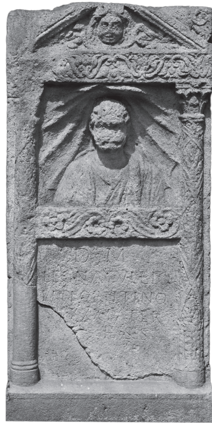
Fig. 7. Stela from Sisak AMZ