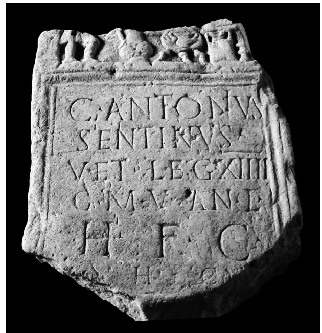
Fig. 4. Funerary stela from Sisak, Gradski muzej Sisak

hand, the motif of the reduced meal is very often depicted on Pannonian funerary stelae, but never as the main scene; it is always submitted to or even merged with the portrait of the deceased (cf. Lupa 691, 2750, 2756, etc.). On balance, the stela from Aljmaš was of the type designed in Norican marble workshops, but it was decorated in a way different from Norico-Pannonian marble pieces of the same type, as well as from north-Pannonian travertine stelae. Therefore, the stone material of the stela from Aljmaš proves its north-Pannonian origin, suggesting at the same time that stone monuments travelled from Aquincum to Mursa as half-products, to be decorated according to individual tastes, manifestly different from those typical of other Pannonian and Norican stonemasonry workshops.