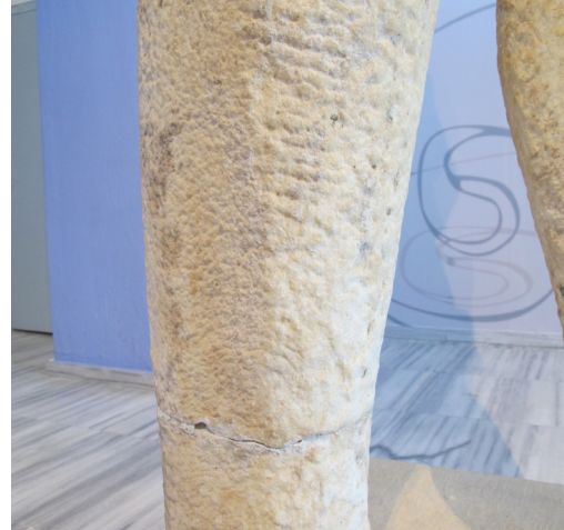
Fig. 9. Right leg, edge formed by two sides of the block cut down