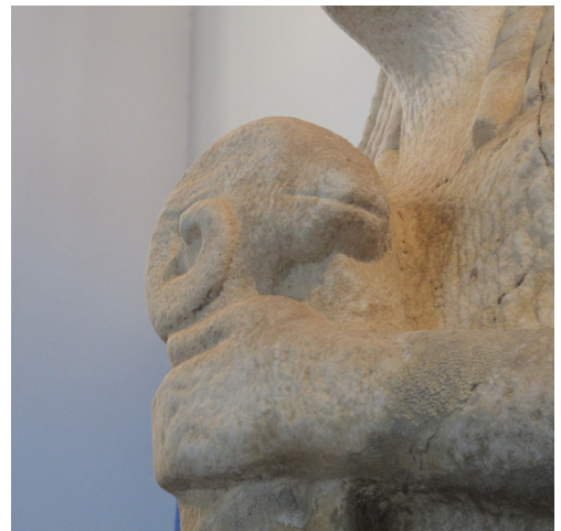
Fig. 11. Ram's head, very short grooves, close to pricking