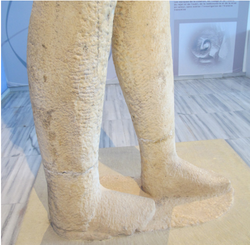
Fig. 7. Side profile of the right foot, thickness of material