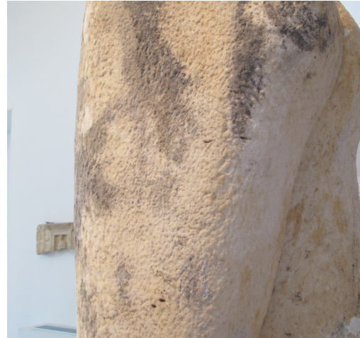
Fig. 10. Left thigh, short grooves ended by impacts