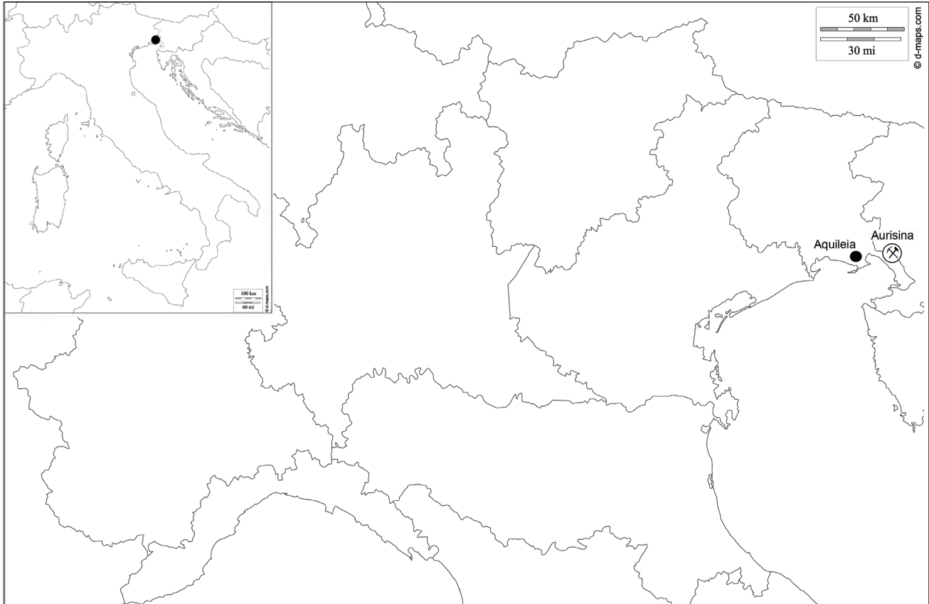
Fig. 1. Map showing the position of the Aurisina quarries (north-eastern Italy), which in the Roman Age were situated in territory belonging to the city of Aquileia