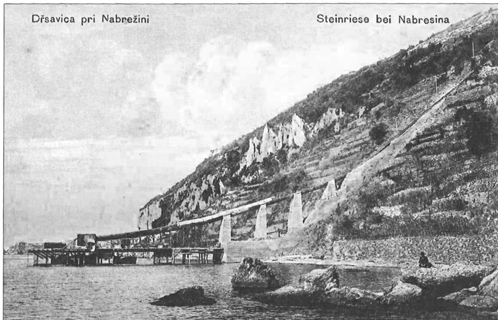
Fig. 6. A slide used at the beginning of the 20 th century to move stone chips and blocks from the quarries to the sea (from: FLEGO, RUPEL, ZUPANČIČ 2001)