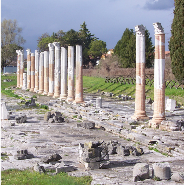
Fig. 8. Aquileia (Udine, Italy). The forum of the colony, entirely constructed in Aurisina limestone. For the square's paving 1500 m 3 of limestone was used