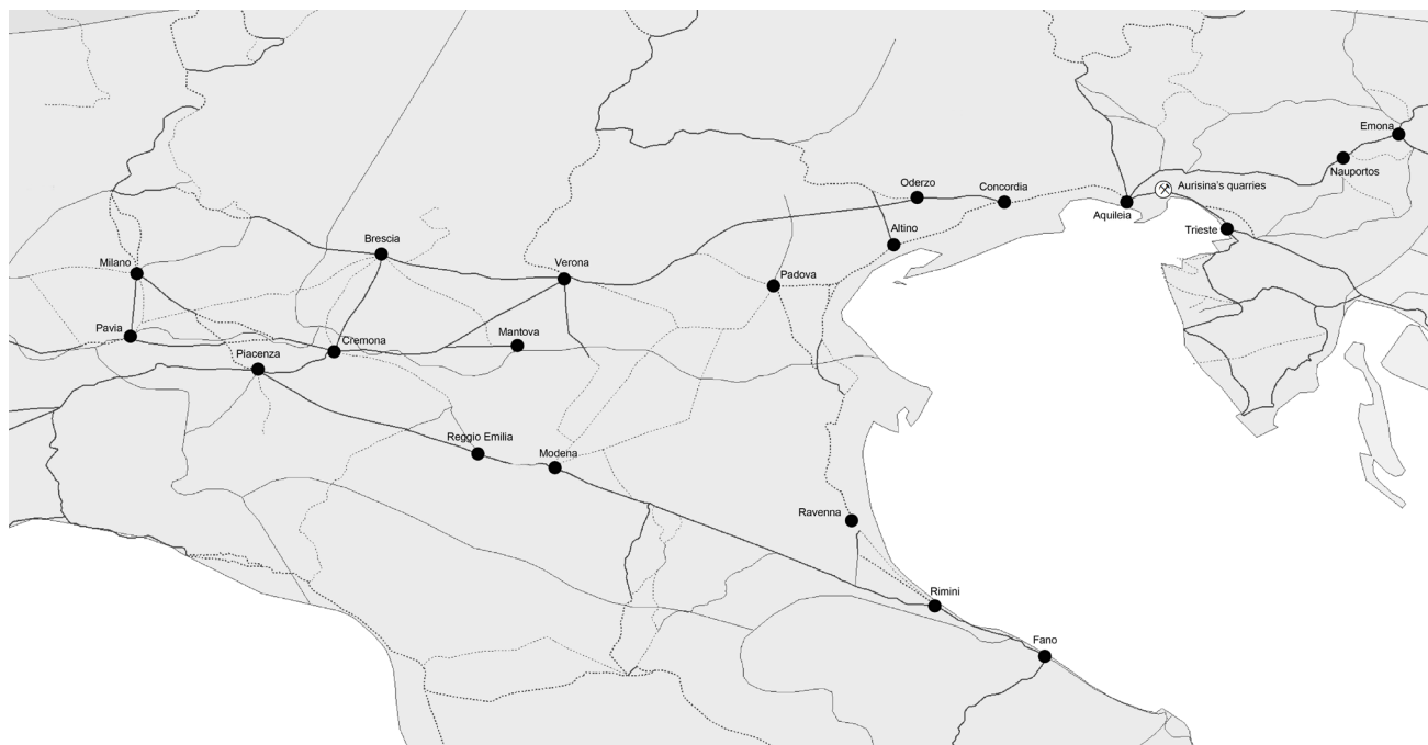
Fig. 7. Map showing the cities where Roman structures or artifacts made of Aurisina limestone have been found

solution was adopted at the end of the 19 th century by a modern company to move stone chippings and blocks from the quarries to the sea (Fig. 6). Other scholars believed that the tunnel of the Cava Romana was not only an extraction site, but also a gallery that linked the quarry to the sea, used in ancient times for the transfer of stones, but there is no evidence to support this hypothesis.