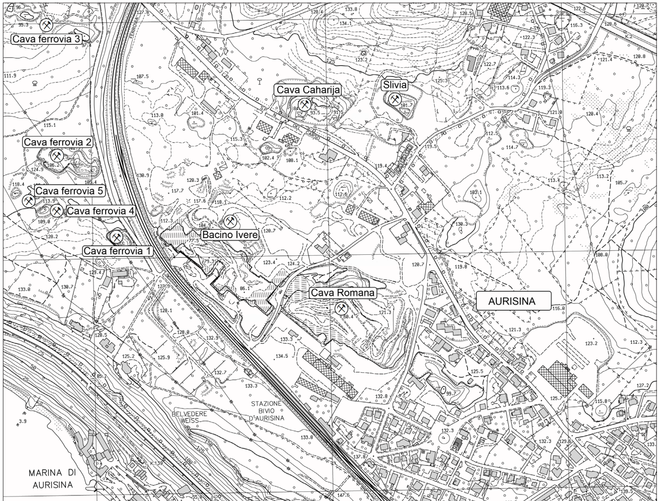
Fig. 3. Map of the quarries situated in the Aurisina extraction basin which have been identified and surveyed (base map CTR 1:5000 n. 109042, Sistiana)

The Aurisina quarries were exploited for a long period, at least until the beginning of the 6 th century, when the great monolith covering the Mausoleum of Teodorico in Ravenna, which is made of Aurisina limestone, was extracted 7 .