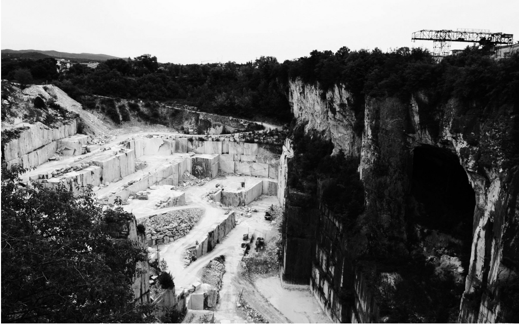
Fig. 4. Aurisina (Trieste, Italy). The Cava Romana quarry. On the right, the tunnel exploited in ancient times. On the left, the active quarry