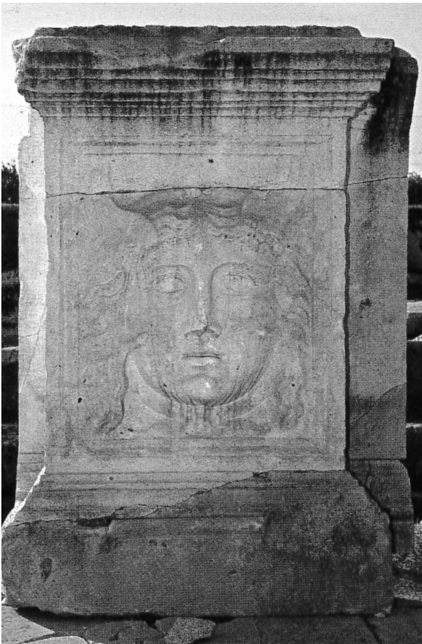
Fig. 9. Aquileia (Udine, Italy). Plinth in Aurisina limestone decorated with the head of Medusa from the forum

the Po and its tributaries. Thus, it could reach some cities of Regio XI situated at a distance of about 400 km from the quarries, like Milano and Pavia. Probably in the same way, the stone reached also some cities of Regio VIII , like Modena and Reggio Emilia. By sea, Aurisina limestone also reached some more distant cities situated along the Adriatic coasts, like Ravenna, Rimini and Fano.